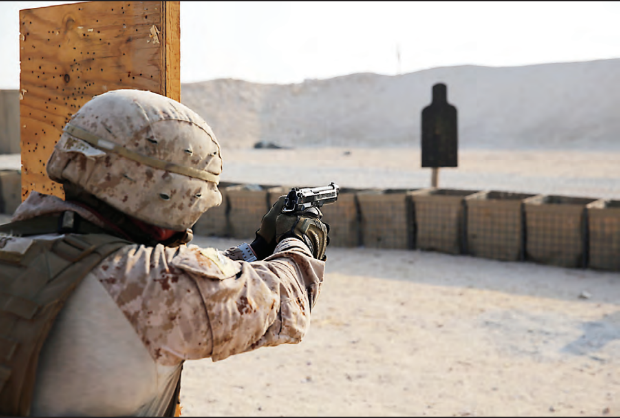
Security Forces Marine with Marine Wing Support Squadron-371, Special Purpose Marine Air-Ground Task Force -- Crisis Response--Central Command fires after transitioning to his pistol during a live-fire, combat maneuver range in Southwest Asia, August 19. The live-fire range is designed to emulate realistic combat conditions and force Marines to shoot, move, and communicate to overcome targets at an unknown distance.

STORY AND PHOTOS BY CPL. JONATHAN BOYNES