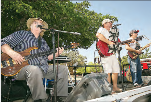
On Tapp, a Morongo Basin local band, performs live music during the Joshua Tree Summer Splash event at the Joshua Tree Community Center, Saturday.