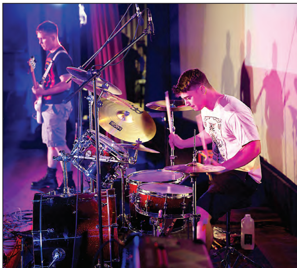
'Out of Regs,' a band made up of Combat Center Marines, performs ska music during the Single Marine Program's annual 'Marines Got Talent' show at the Sunset Cinema, Aug. 21. Performances from 14 competitors varied from solo vocalists to bands with as many as four members.