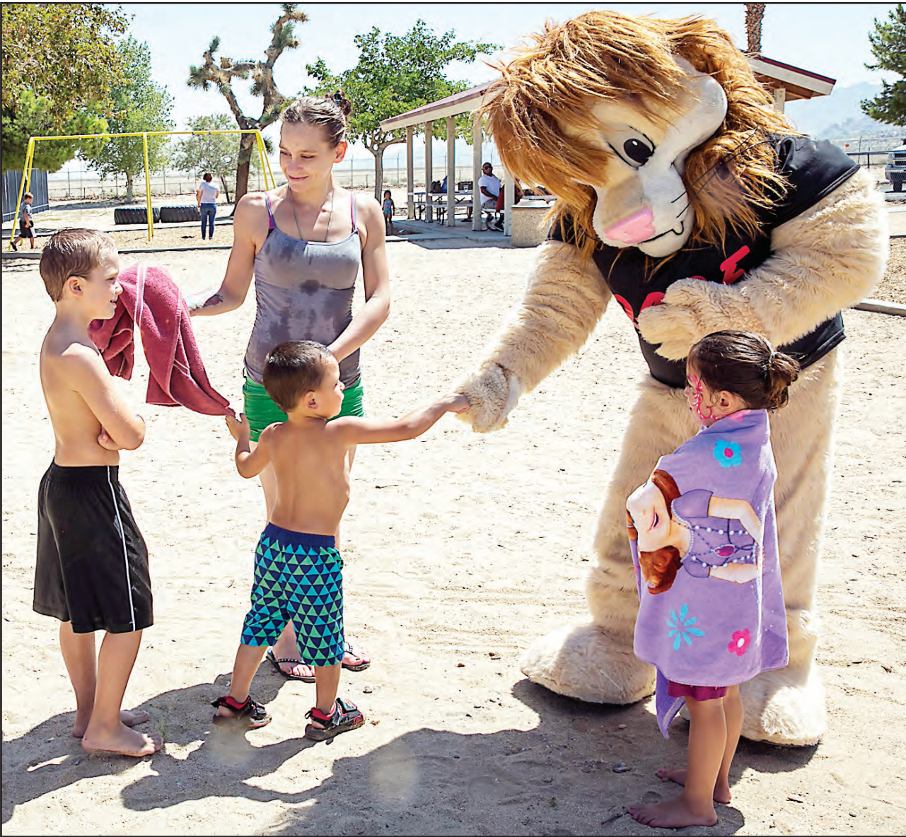
The Provost Marshal’s Office’s Drug Abuse Resistance Education Lion, Daren, interacts with Morongo Basin children at the Joshua Tree Summer Splash event at the Joshua Tree Community Center, Saturday.