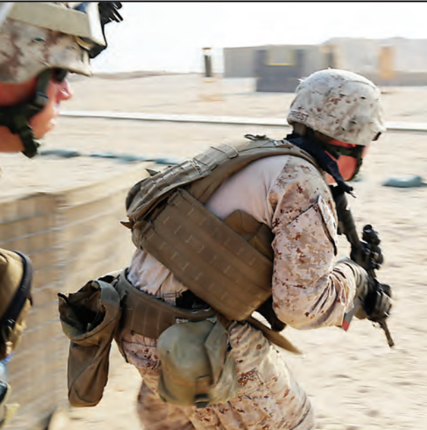
U.S. Marines with Marine Wing Support Squadron-371, Special Purpose Marine Air-Ground Task Force -- Crisis Response--Central Command bound to their next target during live-fire, combat maneuver range in Southwest Asia, August 19. The live-fire range is designed to emulate realistic combat conditions and force Marines to shoot, move, and communicate to overcome targets at an unknown distance.