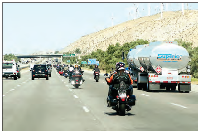
Below, Combat Center Riders leave the Combat Center during the Behavioral Health Branch's Substance Abuse Awareness Ride for Freedom, Freedom to Ride motorcycle event, May 19.