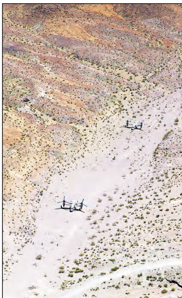
MV-22 Ospreys with Marine Medium Tiltrotor Squadron 363 wait as Marines with 3rd Marine Regiment assess a simulated casualty situation during a tactical recovery of aircraft and personnel training mission for Integrated Training Exercise 3-17 at the Combat Center, May 17.