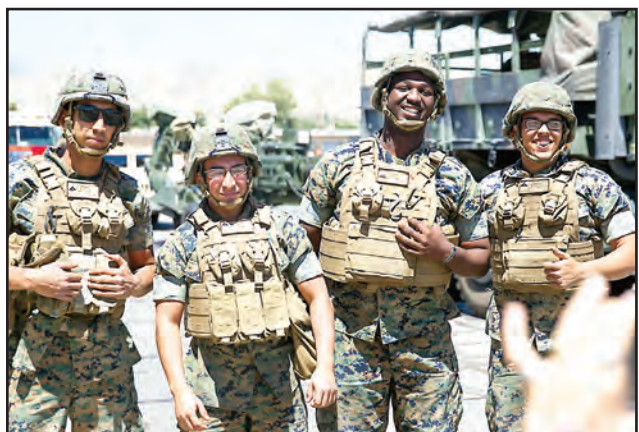
Marines with 3rd Light Armored Reconnaissance Battalion pose for a spectator's photo during the 67th annual Grubstake Days Parade along California Highway 62 in Yucca Valley, Calif., Saturday. The town holds the annual Grubstake Days festival to commemorate the mining heritage of the Yucca Valley community.