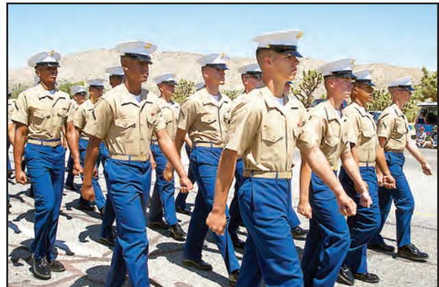
Marines with Marine Corps Communication-Electronics School march during the 67th annual Grubstake Days Parade along California Highway 62 in Yucca Valley, Calif., Saturday. The town holds the annual Grubstake Days festival to embrace the mining heritage of the Yucca Valley community.