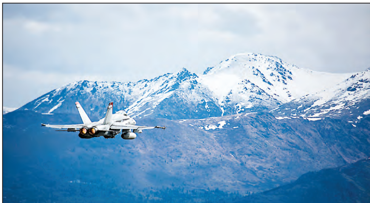
A U.S. Marine Corps F/A-18C Hornet with Marine Fighter Attack Squadron (VMFA) 232 takes off at Joint Base Elmendorf-Richardson, Alaska, May 23. VMFA 232 is participating in exercise Distant Frontier, which is a unit-level training iteration designed to sharpen participants' tactical combat skills and develop interoperable plans and programs across the joint force.