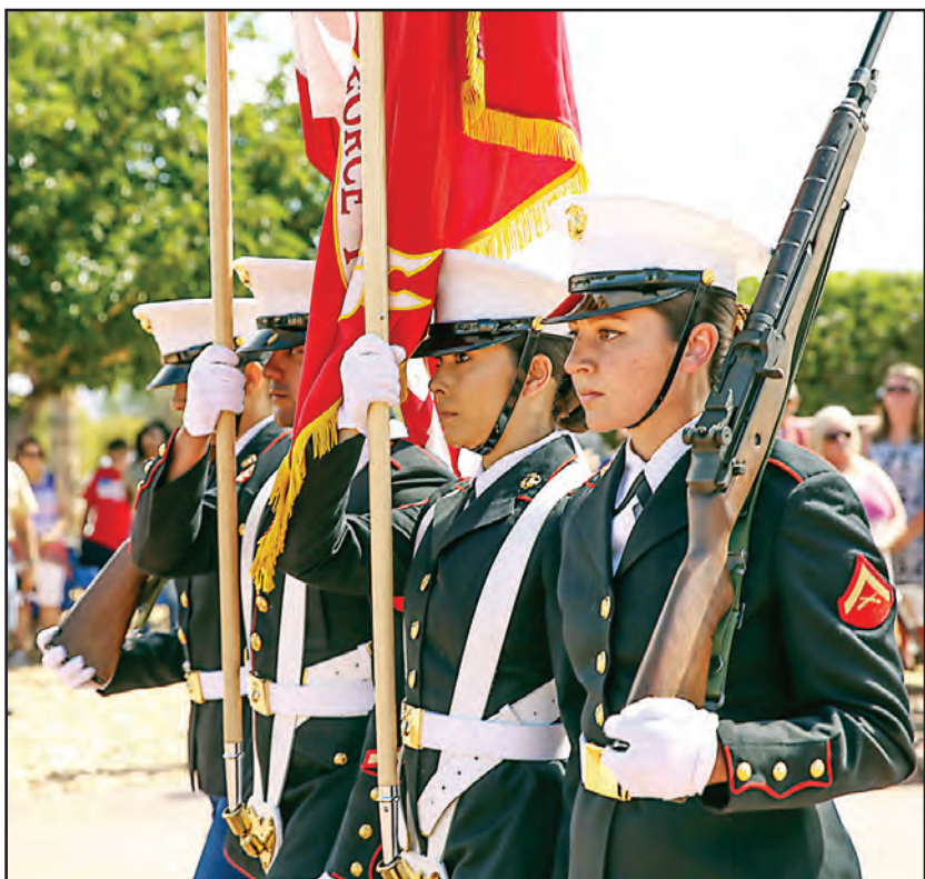
Marines from the Combat Center Headquarters Battalion Color Guard, participate in a Memorial Day Ceremony at the Twentynine Palms Cemetery, Twentynine Palms, Calif., Monday. The annual event is held to honor America's fallen service members.