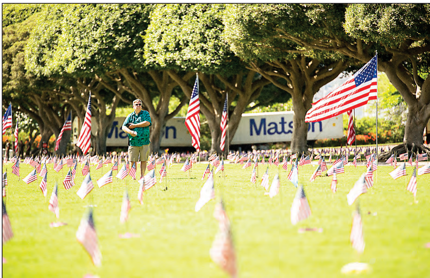
A man stops at a grave of a fallen service member during the 68th Memorial Day Ceremony at the National Memorial Cemetery of the Pacific, Hawaii, Monday. The ceremony was held to honor and remember military service members who made the ultimate sacrifice, including personnel who were held as prisoners of war, defending freedom across the globe.