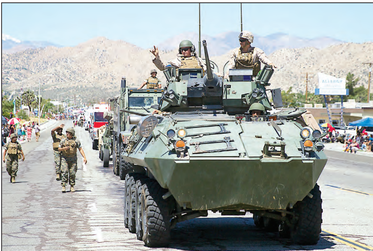
Marines with 3rd Light Armored Reconnaissance Battalion participate in the 67th annual Grubstake Days Parade along California Highway 62 in Yucca Valley, Calif., Saturday. The town holds the annual Grubstake Days festival to commemorate the mining heritage of the Yucca Valley community.