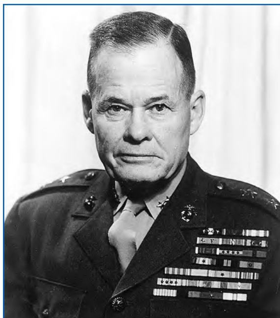
Heroes of the Marine Corps