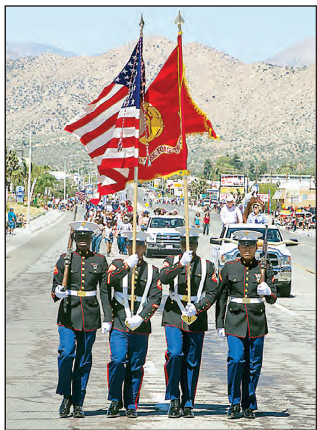
The Combat Center Color Guard leads the parade during the 67th annual Grubstake Days Parade along California Highway 62 in Yucca Valley, Calif., Saturday. The town holds the annual Grubstake Days festival to commemorate the mining heritage of the Yucca Valley community.

The town holds the annual Grubstake Days festival to commemorate the mining heritage of the Yucca Valley