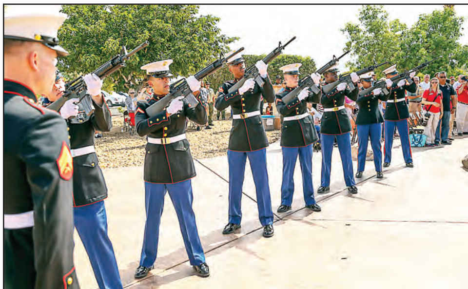
Marines from the Combat Center Headquarters Battalion execute a rifle salute during a Memorial Day Ceremony at the Twentynine Palms Cemetery, Twentynine Palms, Calif., Monday. The annual service is held to honor America's fallen service members.