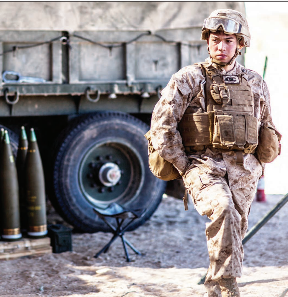
A Marine with Bravo Battery, 1st Battalion, 12th Marine Regiment, 3d Marine Division waits for a drill during Integrated Training Exercise 2-18 at the Combat Center, Jan. 23.