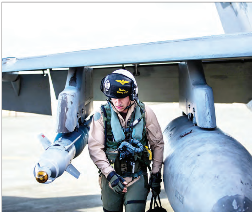
A Marine with Marine Fighter Attack Squadron All-Weather 225 does a pre-flight check of a F-18 at the Air Combat Element landing strip aboard the Combat Center, Jan. 26, as a part of Integrated Training Exercise 2-18.