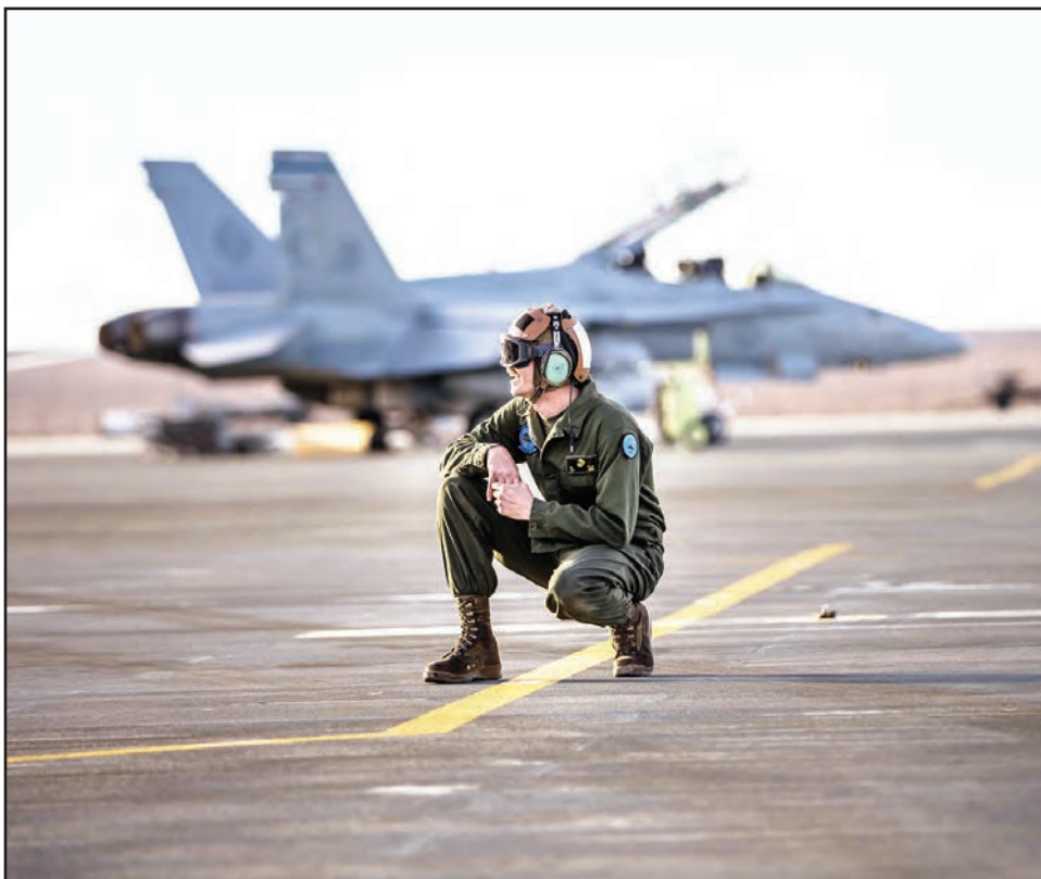
A Marine with Marine Fighter Attack Squadron All-Weather 225 does a pre-flight check of a F-18 at the Air Combat Element landing strip aboard the Combat Center, Jan. 26, as a part of Integrated Training Exercise 2-18.