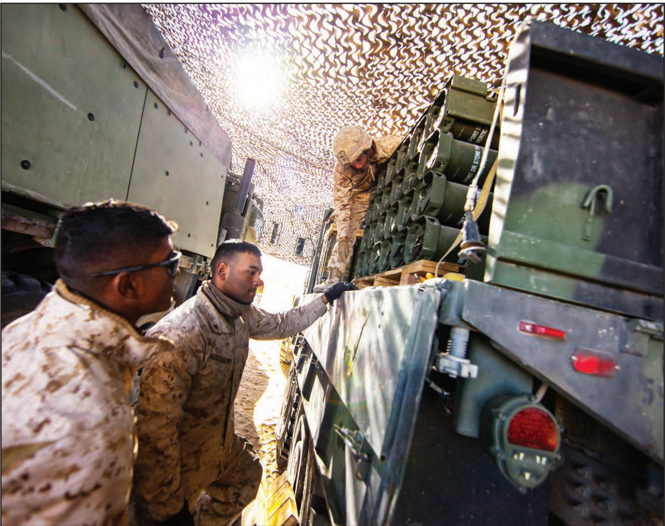
Marines with Bravo Battery, 1st Battalion, 12th Marine Regiment, 3d Marine Division prepare to unload ammunition during Integrated Training Exercise 2-18 at the Combat Center, Jan. 23.