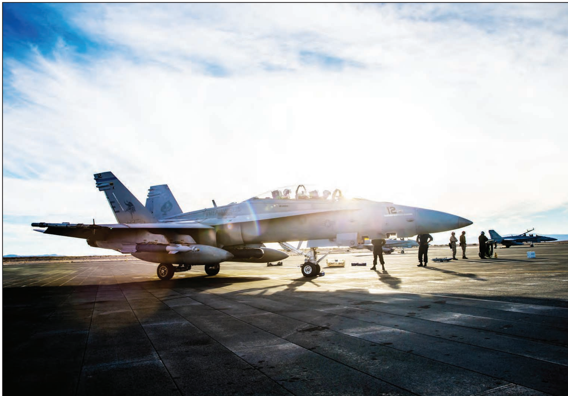
Marines with Marine fight Attack Squadron All-Weather 225 does a pre-flight check of a F-18 at the Air Combat Element landing strip at the Combat Center, Jan. 26, as a part of Integrated Training Exercise 2-18. The purpose of ITX is to create a challenging, realistic training environment that produces combat-ready forces capable of operating as an integrated MAGTF.