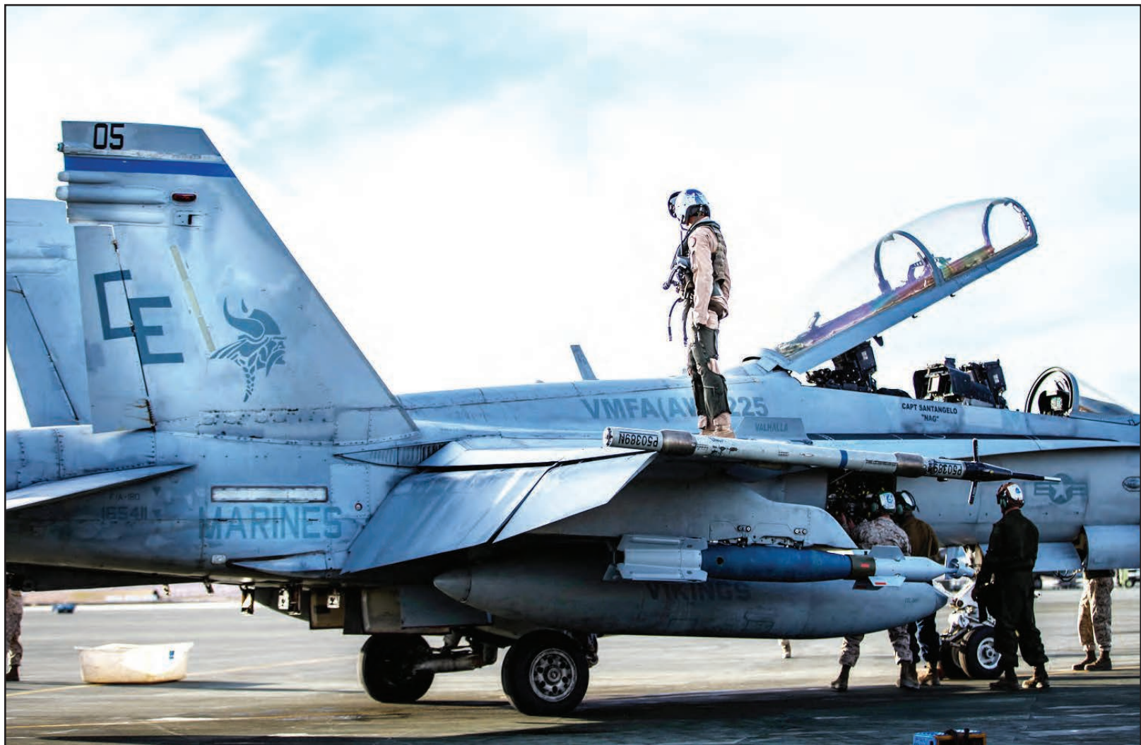
Marines with Marine Fighter Attack Squadron All-Weather 225 does a pre-flight check of a F-18 at the Air Combat Element landing strip aboard the Combat Center, Jan. 26, as a part of Integrated Training Exercise 2-18.