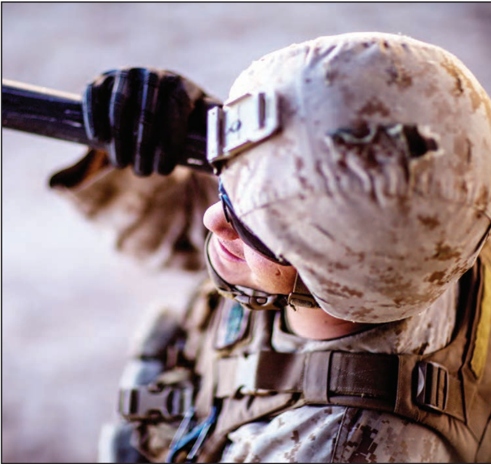
A Marine with Bravo Battery, 1st Battalion, 12th Marine Regiment, 3d Marine Division prepares the M77 Howitzer during Integrated Training Exercise 2-18 at the Combat Center, Jan. 23.