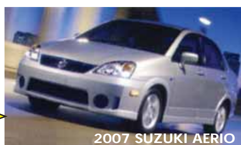
2007 SUZUKI AERIO