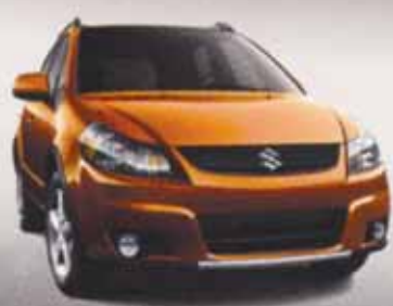
2007 SUZUKI SX4