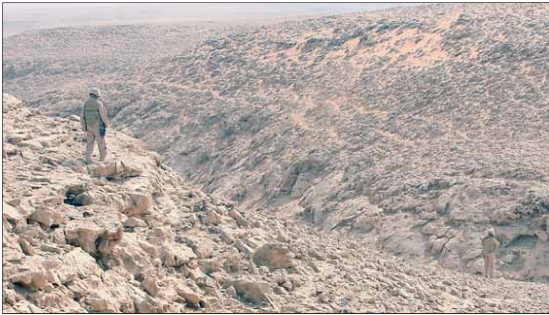
COMBAT OUTPOST RAWAH, Iraq, - A Marine with Company C, 3rd Light Armored Reconnaissance Battalion, Regimental Combat Team 2, stands on a ridge line and looks into the valley left behind from a dried up river. The company swept through the valley in the western Anbar Province searching for insurgents, weapons and illegal material during Operation Mawtini III.

"I'd like to work us out of a job," laughed the 21-year Marine Corps veteran. "I'd like to see the Iraqi Army in control of the battlespace, the police in complete control of the towns, and rule of law firmly established, so criminals can be tried and convicted. That's my goal, to work us out of a job."