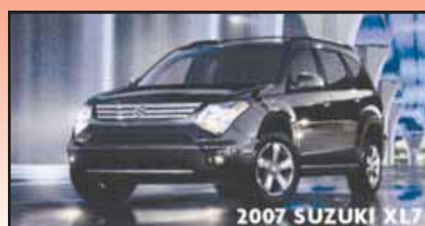
2007 SUZUKI XL7

UP TO $5,500 IN REBATES AND DISCOUNTS ALL '07'S MUST GO! 0% APR UP TO 48 MONTHS +X