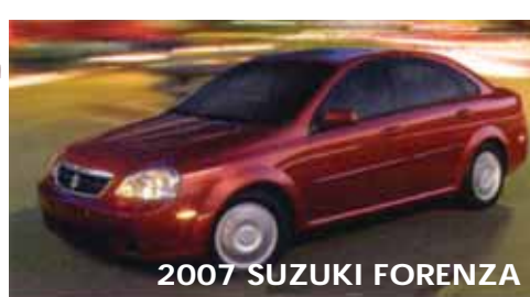
2007 SUZUKI FORENZA