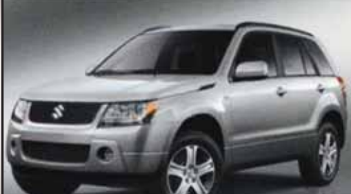
2007 SUZUKI GRAND VITARA