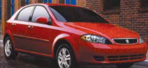
2007 SUZUKI RENO