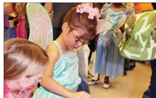
Family fun at the fall festival. Children were able to dress up and participate in Trick-or-Treating and games.