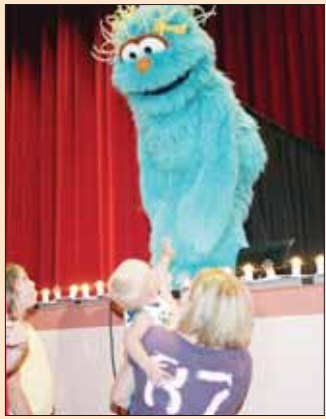
3 Elmo and friends visit the Combat Center