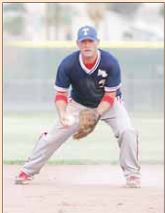
7 Softball All-stars play close game