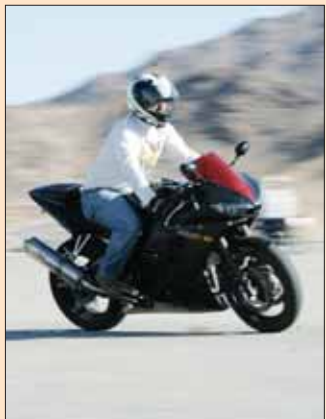
9 Motorcycle course teaches safety to riders