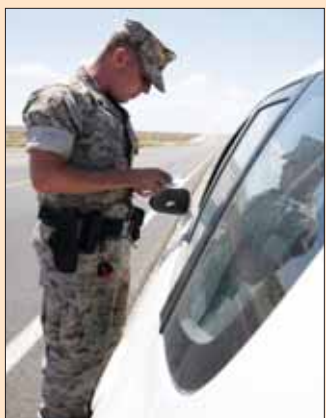
12 Military police always on the beat