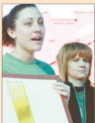
9 Wives spend the day in combat boots