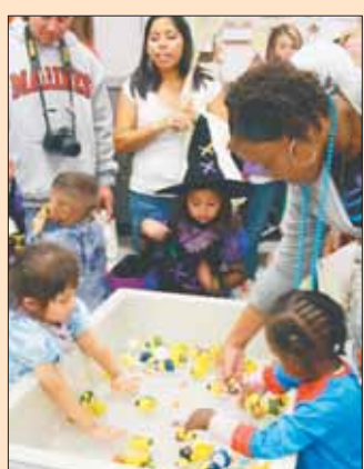
6 Children celebrate the season at Fall Fest