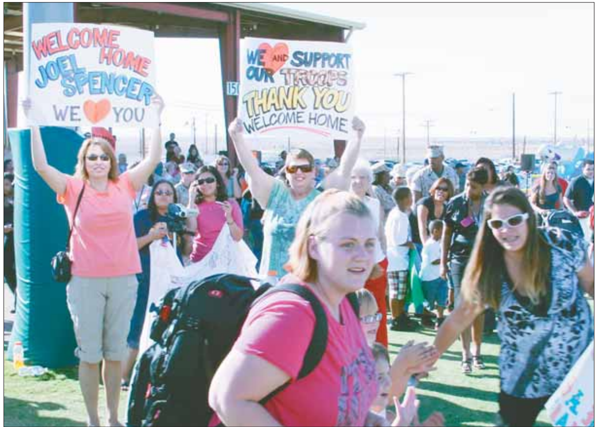
Friends, family and fellow "Rhinos" cheered and held up signs to welcome home the Marines and sailors of Marine Wing Support Squadron 374 from Iraq at Victory Field Oct. 22.

noncombat-related injuries, Btry. M had no Marines killed or wounded during their deployment.