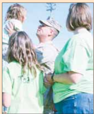
5 Flood of homecomings at Combat Center