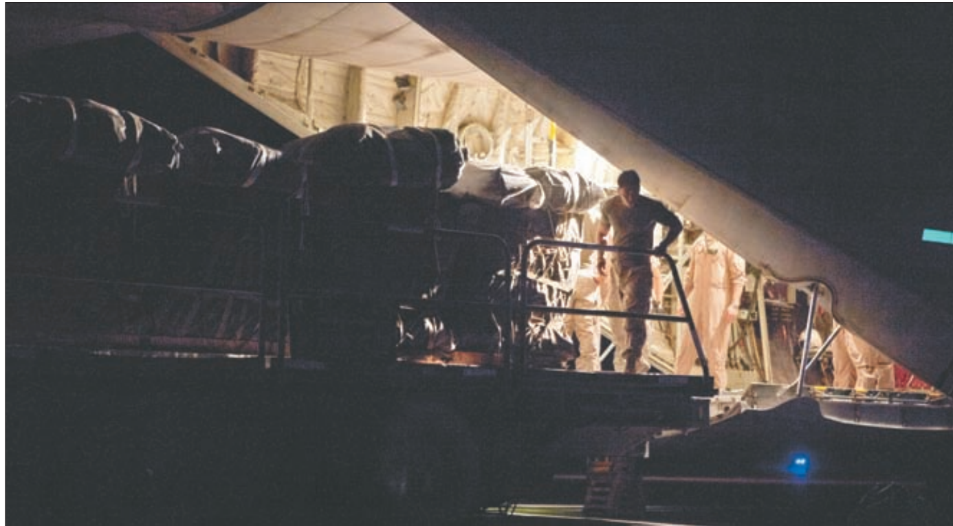
Marines with 2nd Marine Logistics Group (Forward) and Marine Aerial Refueler Transport Squadron 252 load cargo onto a KC-130J Super Hercules airplane, under the stars at Camp Bastion, Afghanistan, Sept. 5. VMGR-252 conducted an aerial drop to re-supply ground troops with necessary supplies of ammunition, food and water.

Laden pallets in a KC-130J Hercules await transport. Marines with Marine aerial refueler transport squadrons deployed in support of NATO International Security Assistance Force operations moved cargo over Afghanistan, Sept. 5.