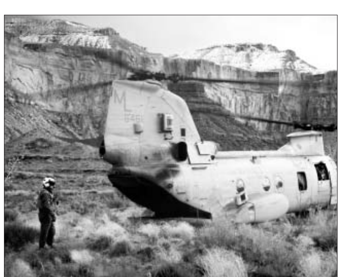
HMM-764 flew CH-46E helicopters into the Grand Canyon during Operation Havasupai. HMM-764's mission was to join the Flagstaff Community Toys For Tots organization in delivering Santa Claus and toys to children of the Havasupai tribe, as well as conduct training operations throughout the Grand Canyon.