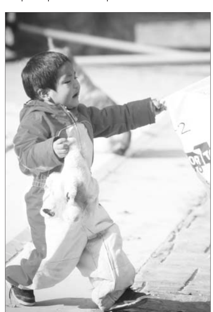
A young boy of the Havasupai tribe wrestles with his father for a gift bag flown into the Grand Canyon by HMM-764.