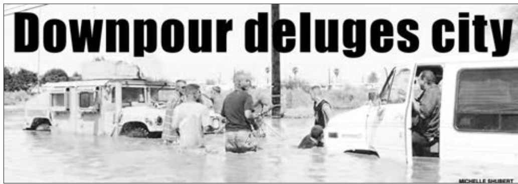
By Kurt Schaupner

Reprinted from the Observation Post dated Aug. 8, 2008, Vol. 51 Issue No. 32