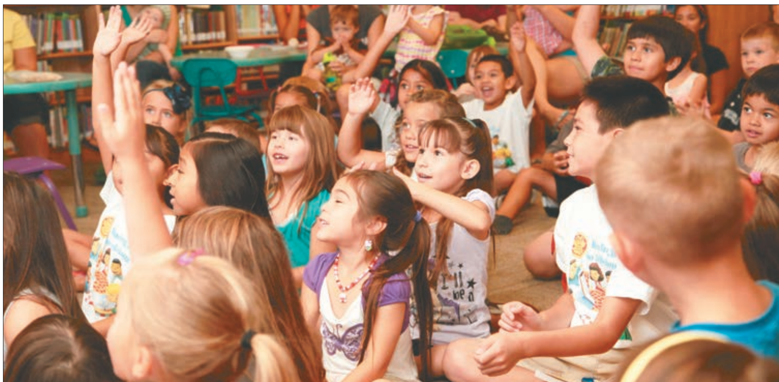
[Right] Combat Center kids play a game of Crazy Soup Aug. 3 at the last meeting of the Lifelong Learning Library's Summer Reading Program.