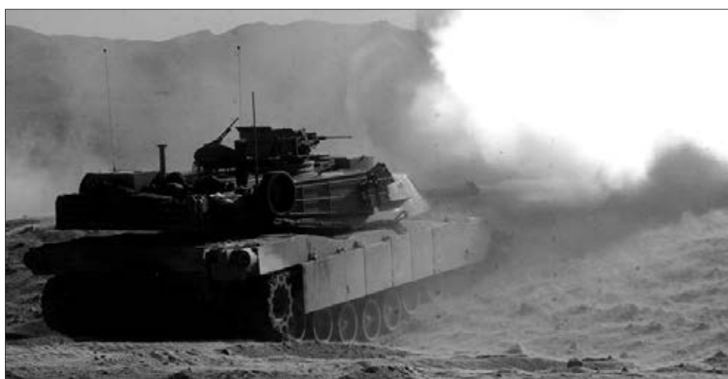
CPL. ALI AZIMI

The unit's next stage in ITX will be a battalion-sized live-fire final exercise.