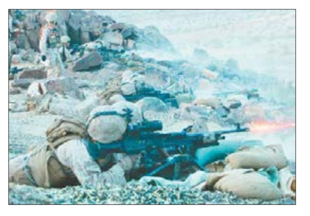
Marines with 1st Battalion 8th Marine Regiment provide suppression from Machine gun hill on range range 410 Oct. 29.