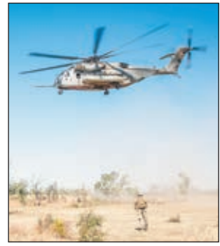
Marines with Bravo Com-Marine Regiment, Marine Rotational Force-Darwin,