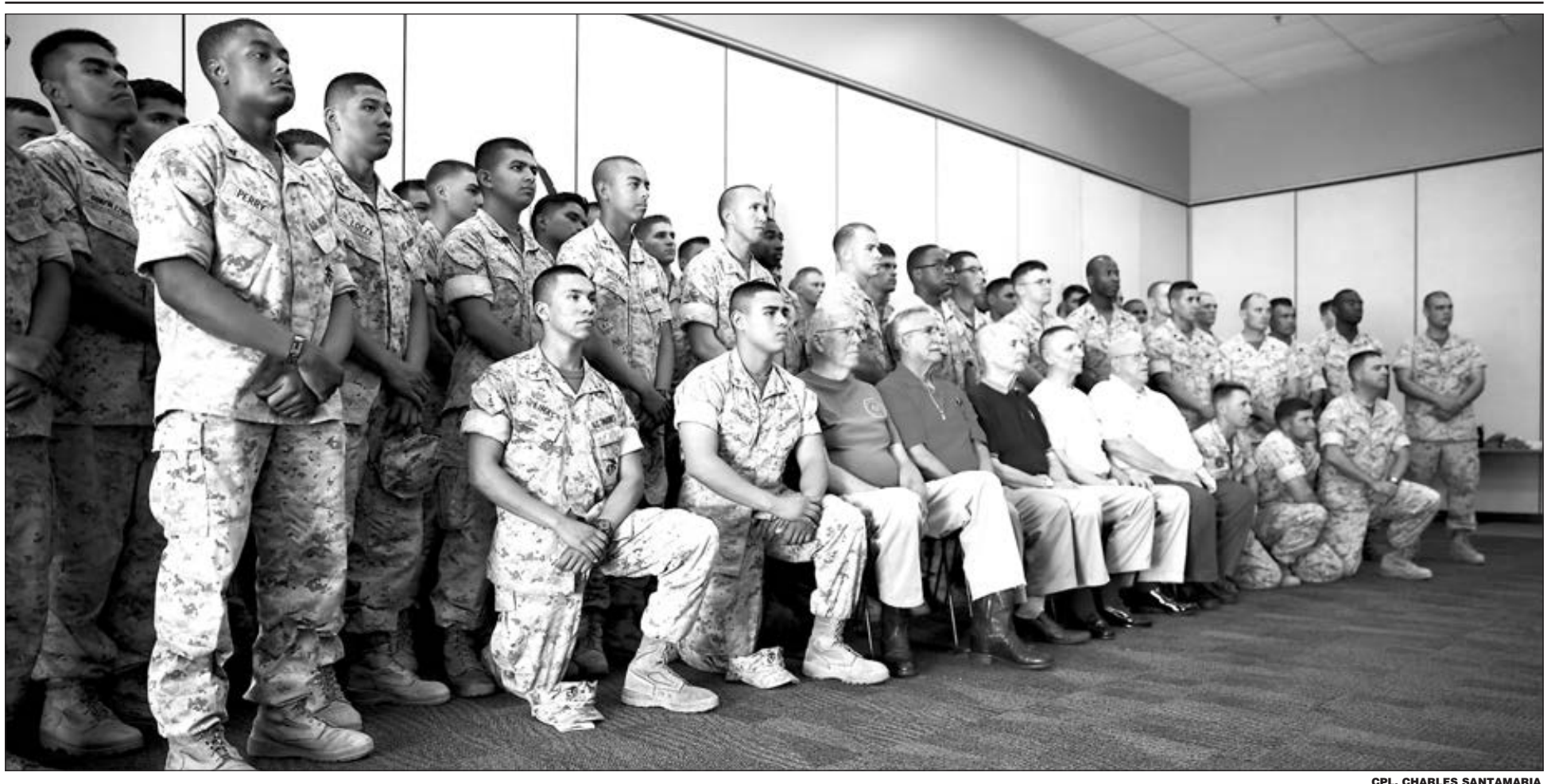
Members of the 1st Marine Division Association, Phoenix Chapter, sit with Marines with E Co., 2nd Battalion, 7th Marine Regiment, during the coin presentation ceremony at Building 1707 aboard the Combat Center, Aug. 22.