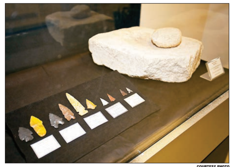
Arrowheads on display at the Combat Center Archaeology and Paleontology Curation Center range from 10,000 years old on the left, to 100 years old on the right. Next to them is a milling slab and hand stone that inhabitants of the installation's Deadman Lake area used to grind things like mesquite beans.

Combat Center before the region became a desert.