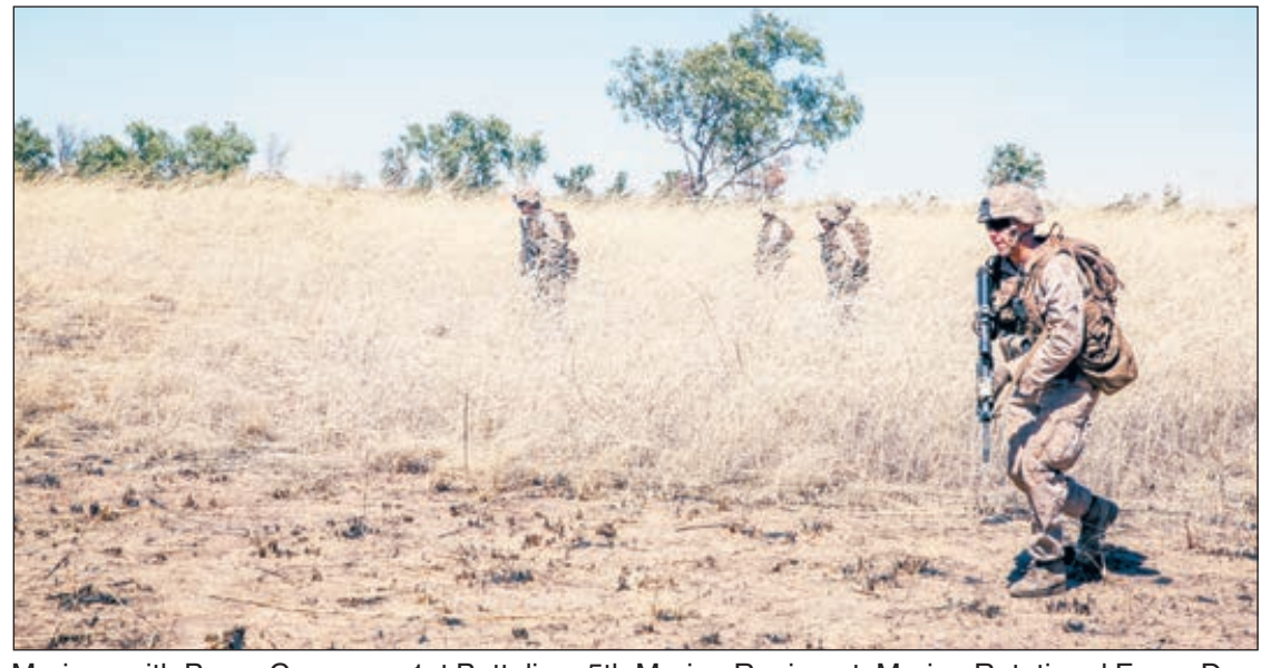
Marines with Bravo Company, 1st Battalion, 5th Marine Regiment, Marine Rotational Force-Darwin, move as a unit to overtake objectives during a live-fire exercise at Bradshaw Field Training Area during Exercise Koolendong, August 2014.