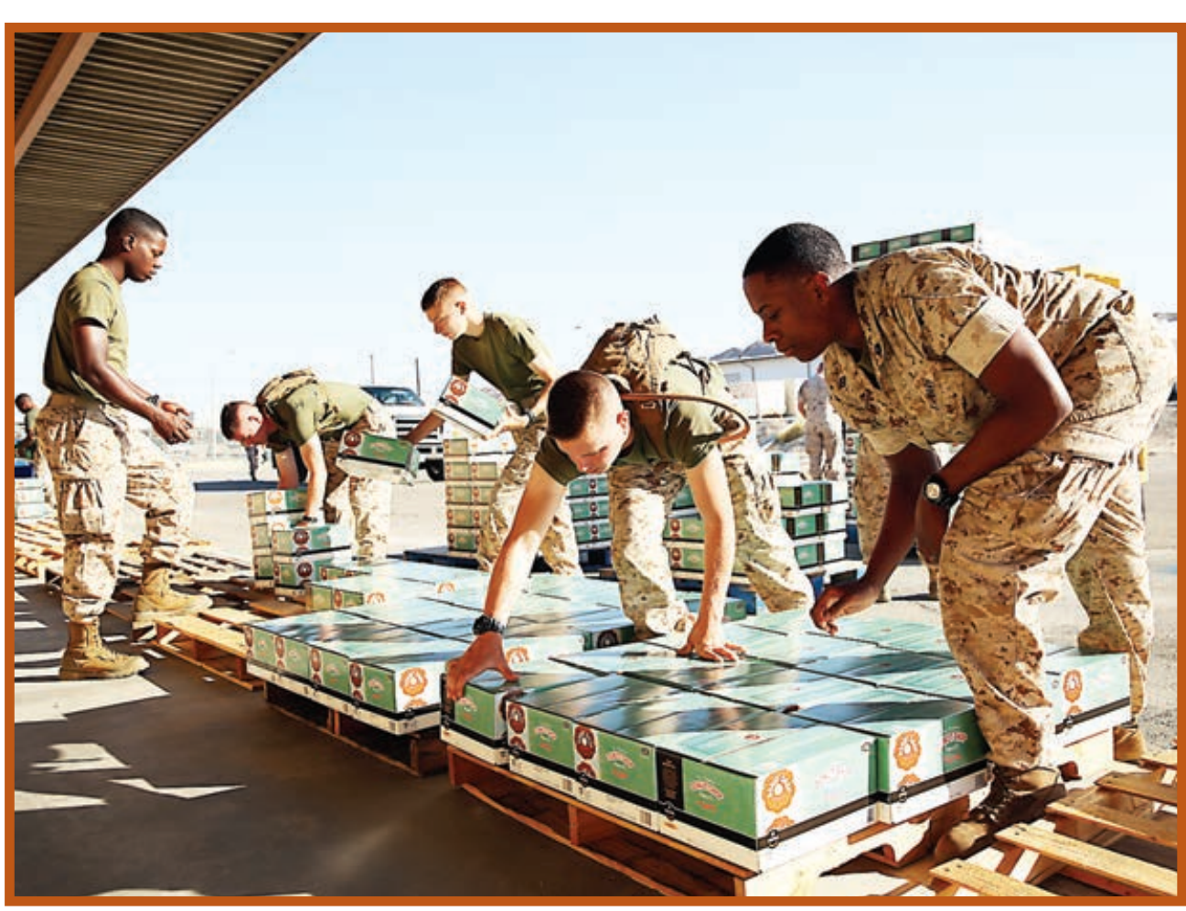
Marine Corps Communication-Electronics School students help redistribute boxes of coffee onto new pallets at a loading dock for Operation Coffee Giveaway with donated Keurig cups and ground coffee from Holy Joe's Café, Aug. 21, 2014.