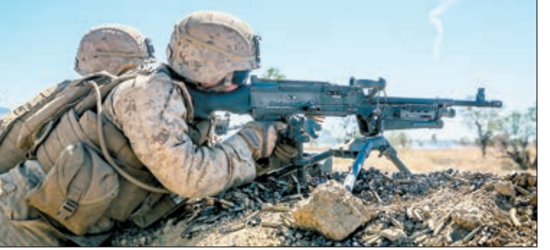
Marines with Bravo Company, 1st Battalion, 5th Marine Regiment, Marine Rotational Force-Darwin, provide supporting machine gun fire during a live-fire exercise at Bradshaw Field Training Area during Exercise Koolendong.