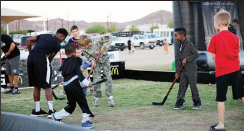
Children play a game of hockey at Del Valle Field during the Family Fall Festival, Oct. 24. The event is annual and on average, anywhere from 3,000 to 5,000 people attend.