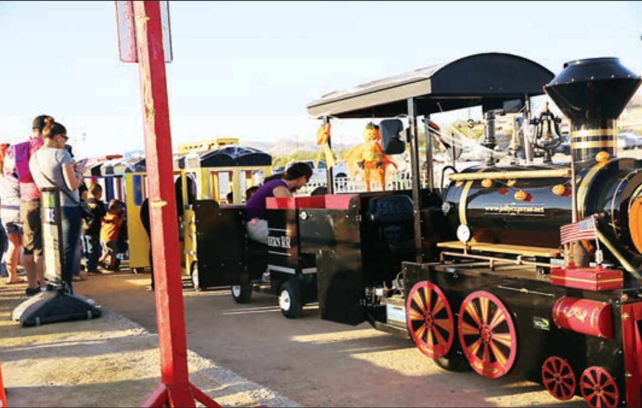
Children board a train at Del Valle Field during the Family Fall Festival, Oct. 24. Marine Corps Community Services' special events section took over the Family Fall Festival approximately four years ago and is the biggest event they host.