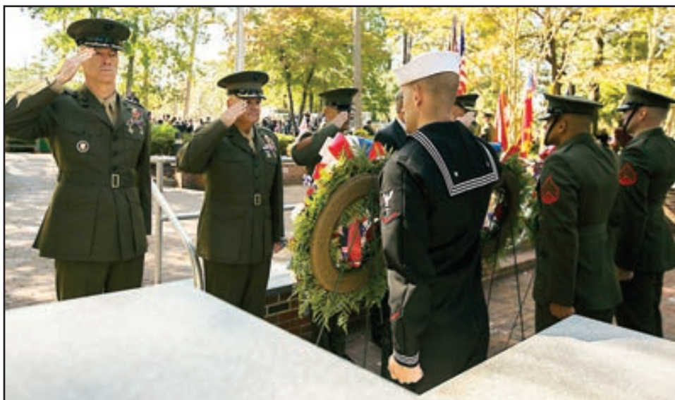
Wreath bearers salute at the front of the Beirut Memorial in Jacksonville, N.C., during the Beirut Memorial Ceremony Oct. 23. Thirty-one years after the attack on the Marine barracks in Beirut, Lebanon, Americans still reflect on what happened. The memorial, comprised of granite walls etched with the names of those who perished, stands as a testament to those that lost their lives.