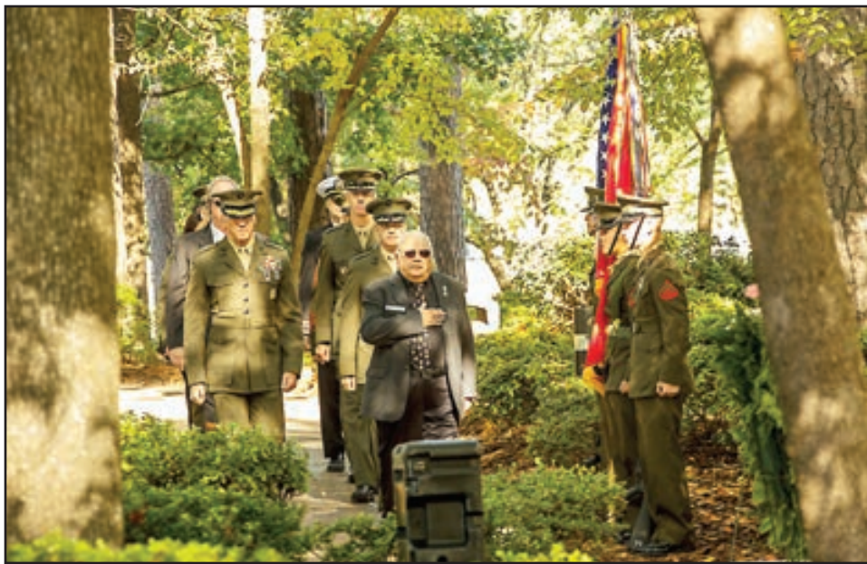
Guests of honor walk past a Marine color guard as they make their way to the main stage in front of the Beirut Memorial in Jacksonville, N.C., during the Beirut Memorial Ceremony Oct. 23. Thirty-one years after the attack on the Marine barracks in Beirut, Lebanon, Americans still reflect on what happened. The memorial, comprised of granite walls etched with the names of those who perished, stands as a testament to those that lost their lives.