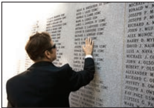
A visitor runs his fingers along the names etched into the wall at the Beirut Memorial in Jacksonville, N.C., after the Beirut Memorial Ceremony Oct. 23. When a truck loaded with explosives drove into the Marine barracks in Beirut, Lebanon on the morning of Oct. 23, 1983, 241 service members were killed.