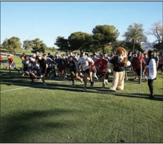
Participants begin the Red Ribbon Week 5K race at Desert Winds Golf Course, Oct. 23. The race signified the beginning of Red Ribbon Week which raises drug abuse awareness.