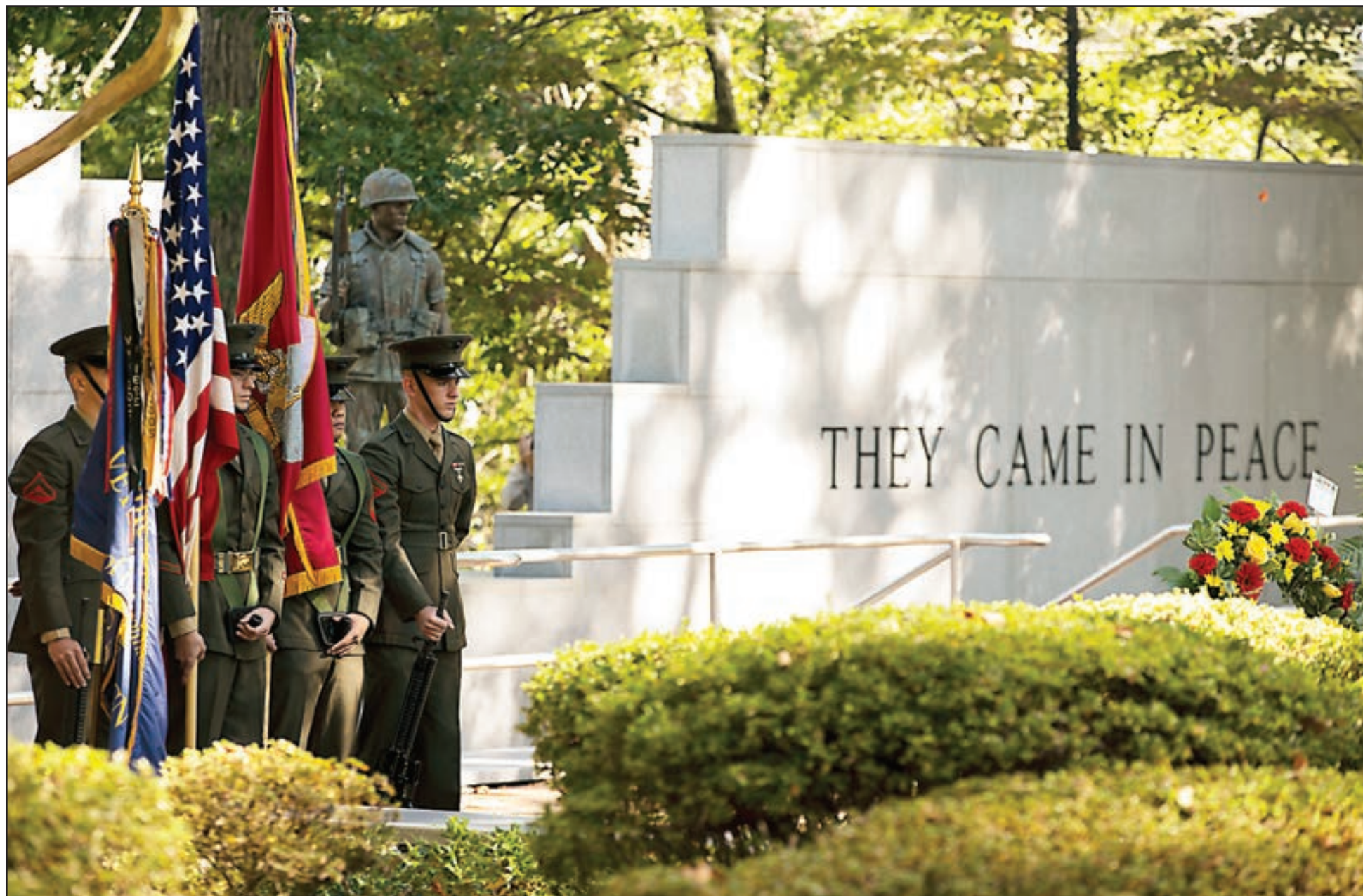
A Marine color guard stands at parade rest in front of the Beirut Memorial in Jacksonville, N.C., during the Beirut Memorial Ceremony Oct. 23. The memorial, comprised of a granite wall etched with the names of those who died in the bombing at the Marine barracks in Beirut, Lebanon, stands as a testament to those that lost their lives and a reminder of the true cost of freedom.