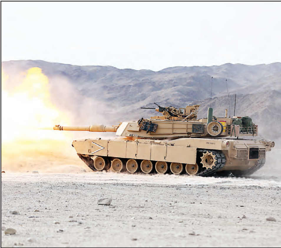
An M1A1 Abrams Tank from 1st Tank Battalion, Company B, fires its 120 mm main gun toward a target 1200 meters away during an assault on a Military Operation in Urban Terrain town on Range 210 during the Marine Corps Combat Readiness Evaluation Exercise, Jan. 20. '1st Tanks' and 3rd Assault Amphibian Battalion supported 3rd Battalion, 7th Marine Regiment during their assault of the MOUT.