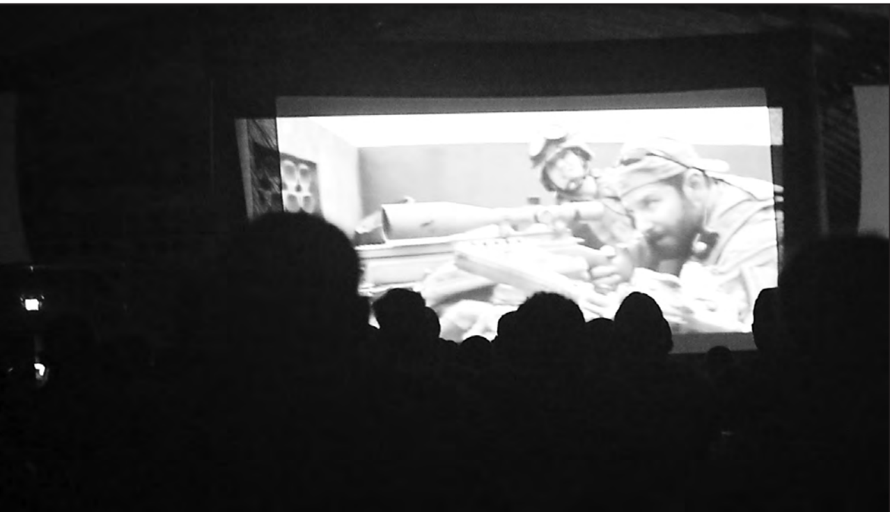
Marines and sailors enjoy a free showing of “American Sniper” at Camp Wilson, Jan. 21. The Camp Wilson officer in charge wanted to provide the service members a chance to relax before the 30-day Integrated Training Exercise 2-15 began, Jan. 22.