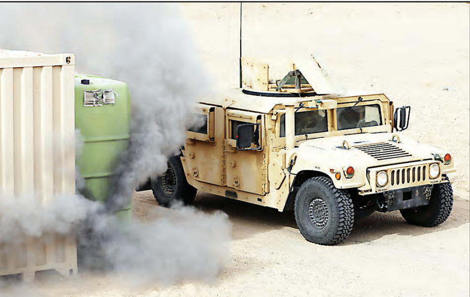
An improvised explosive device stops a convoy during the Combat Center's Chaplain and Religious Program Specialist Expeditionary Training on range 215, Jan. 20. This training evolution tested a Religious Ministry Teams response in the event of being in a combat zone.