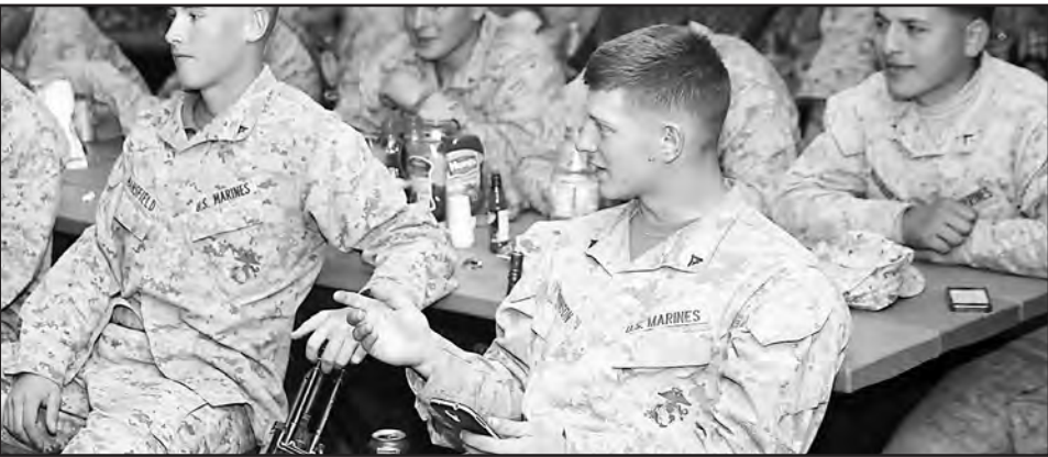
Marines patiently wait and converse among themselves prior to a free showing of “American Sniper” at Camp Wilson, Jan. 21. At the event, the Marines and sailors were offered free snacks and beverages to enjoy during the movie.