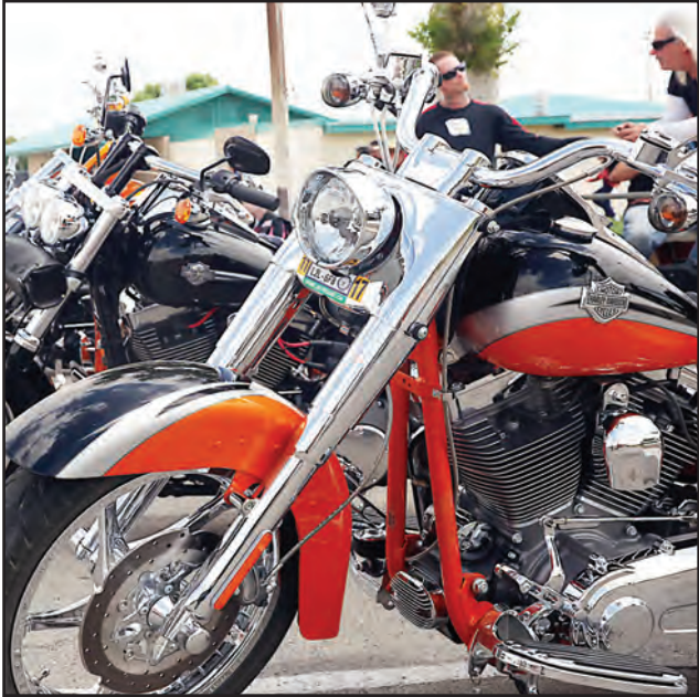
Harley-Davidson motorcycles are displayed during the Twentynine Palms Car Show and Street Fair at Luckie Park in Twentynine Palms Calif., Saturday. More than 65 Vehicles were entered in the car show.