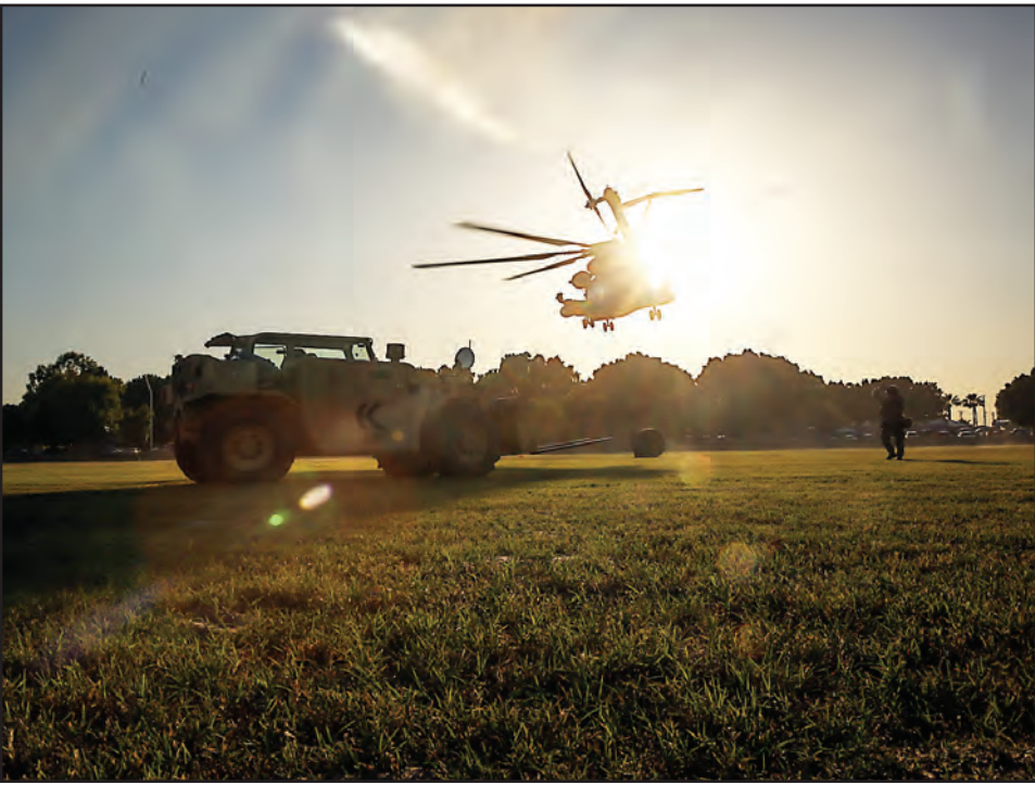
A CH-53E Super Stallion helicopter departs Kiwanis Park, Yuma, Ariz., after dropping supplies for Marines and Sailors with 1st Battalion, 5th Marine Regiment who were providing security during a foreign humanitarian assistance exercise as part of Weapons and Tactics Instructor Course 2-15, April 17.