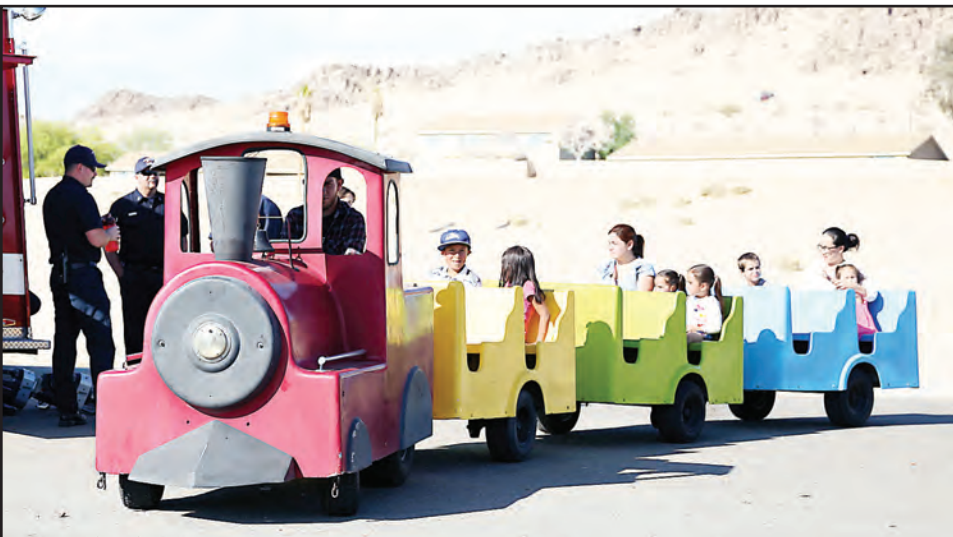
Combat Center families enjoy a ride on a miniature train through Lincoln Military Housing Athletic Field parking lot during the Earth Day Extravaganza, April 24.