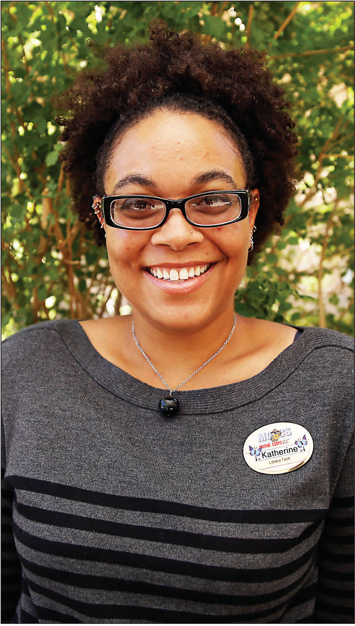
INTERVIEW AND PHOTO BY LANCE CPL. THOMAS MUDD