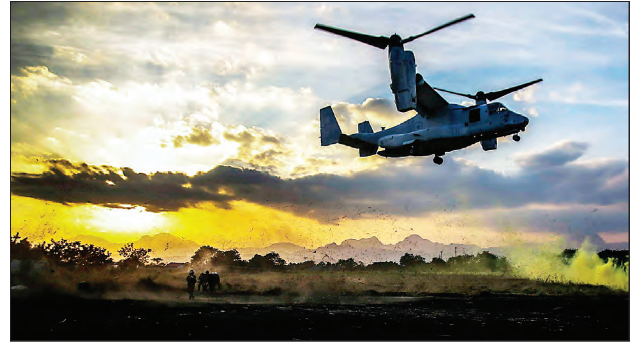
Philippine Marines train with U.S. Marines attached to the III Marine Expeditionary Force/Marine Corps Installations Pacific during a fast-rope exercise Jan. 22 at Basa Air Field, Philippines.