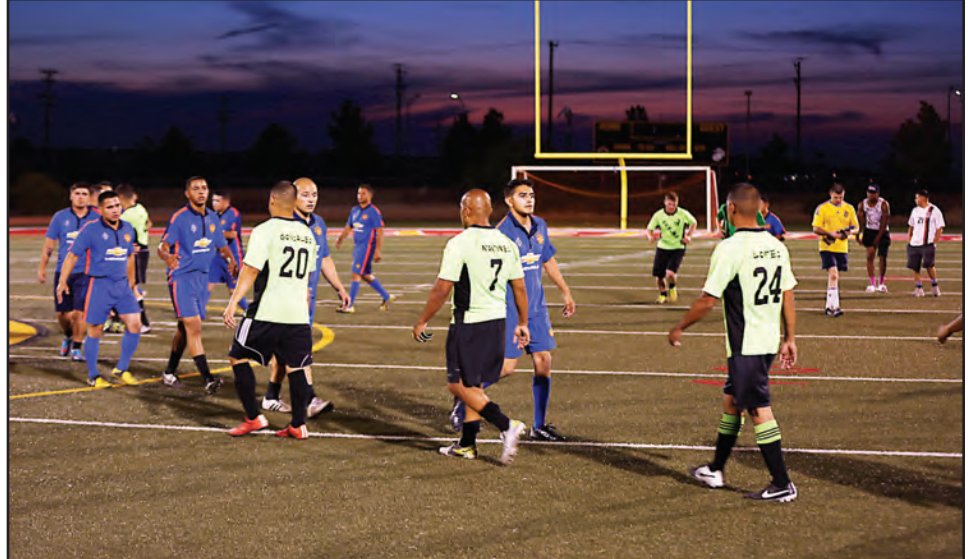
1st Battalion 7th Marine Regiment and 1st Tank Battalion soccer teams shake hands after their match at Combat Center Soccer League's semi-final game May 19, 2015. 1st tanks won the match with a score of 3-2.