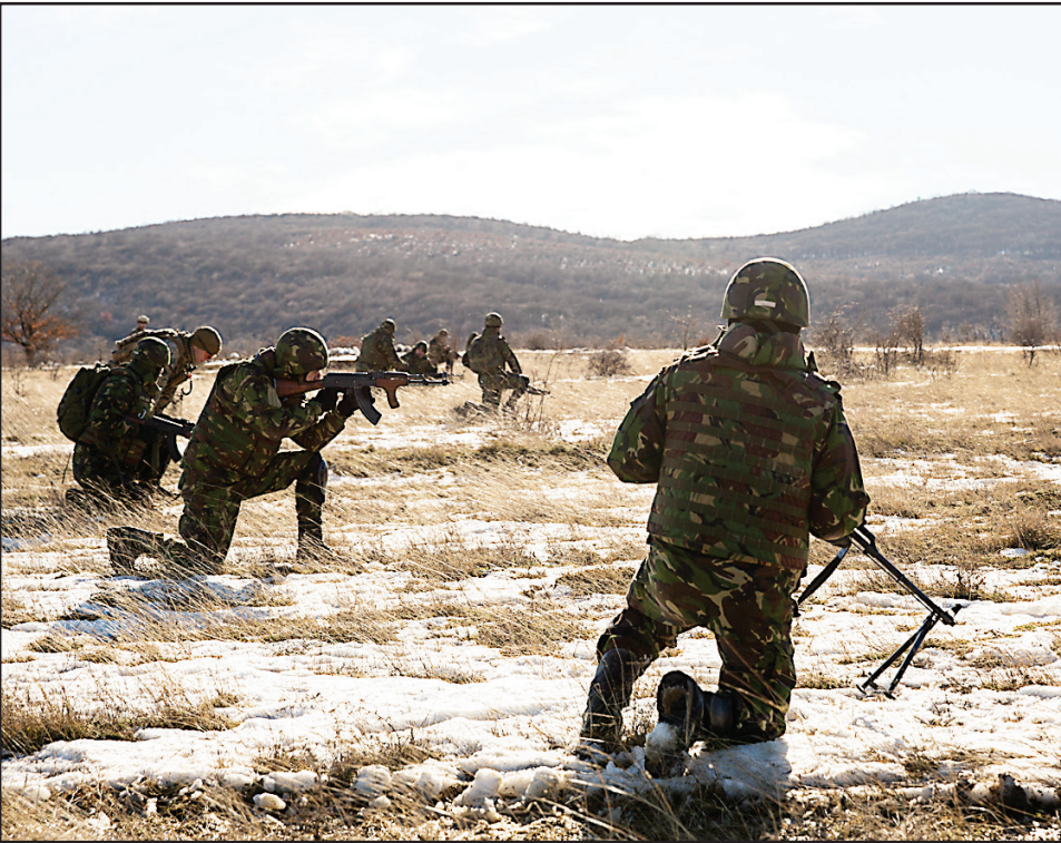
Marines with the Combined Arms Company, Black Sea Rotational Force and Romanian Forces rehearse an Anti-Personnel Obstacle Breaching System breach during Platinum Lion 16-2 at Novo Selo Training Area, Bulgaria, Jan. 8. An APOBS breach is used to clear a foot path through a wire, or mine field, obstacle for personnel. Exercise Platinum Lion provides combined training with NATO Allies and partners, demonstrating our commitment to promoting a peaceful and stable Europe through theatre security cooperation engagements.