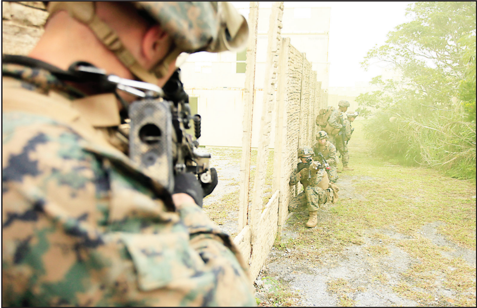
U.S. Marines assigned to Weapons Company, Battalion Landing Team 1st Battalion, 5th Marines, 31st Marine Expeditionary Unit, patrol through Combat Town while conducting urban warfare training on Camp Hansen, in Okinawa, Japan, Jan. 8.