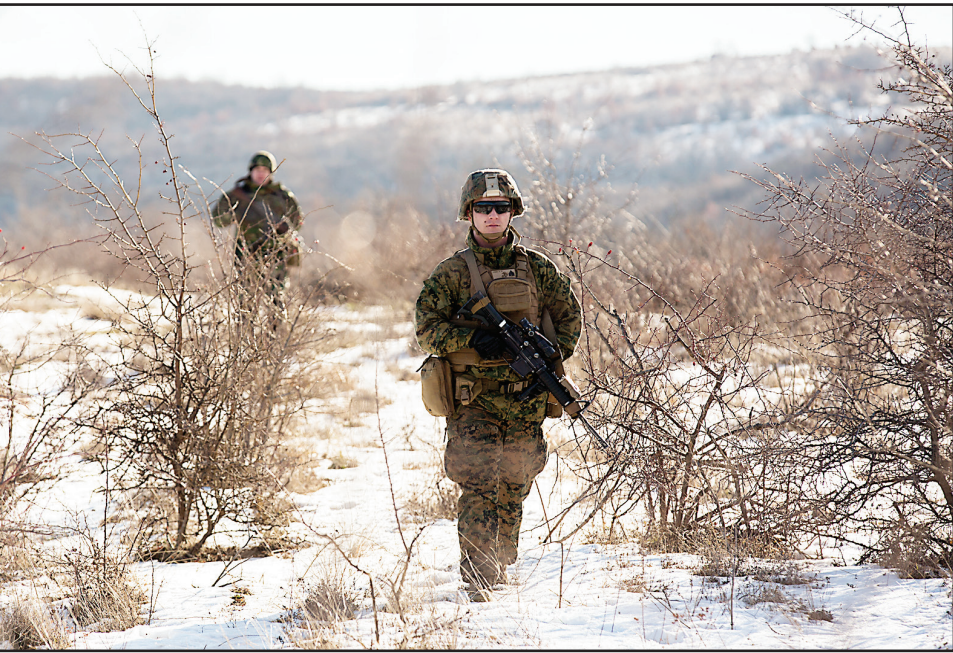
Marines with the Combined Arms Company, Black Sea Rotational Force and Romanian Forces conduct patrols during Platinum Lion 16-2 at Novo Selo Training Area, Bulgaria, Jan. 8.