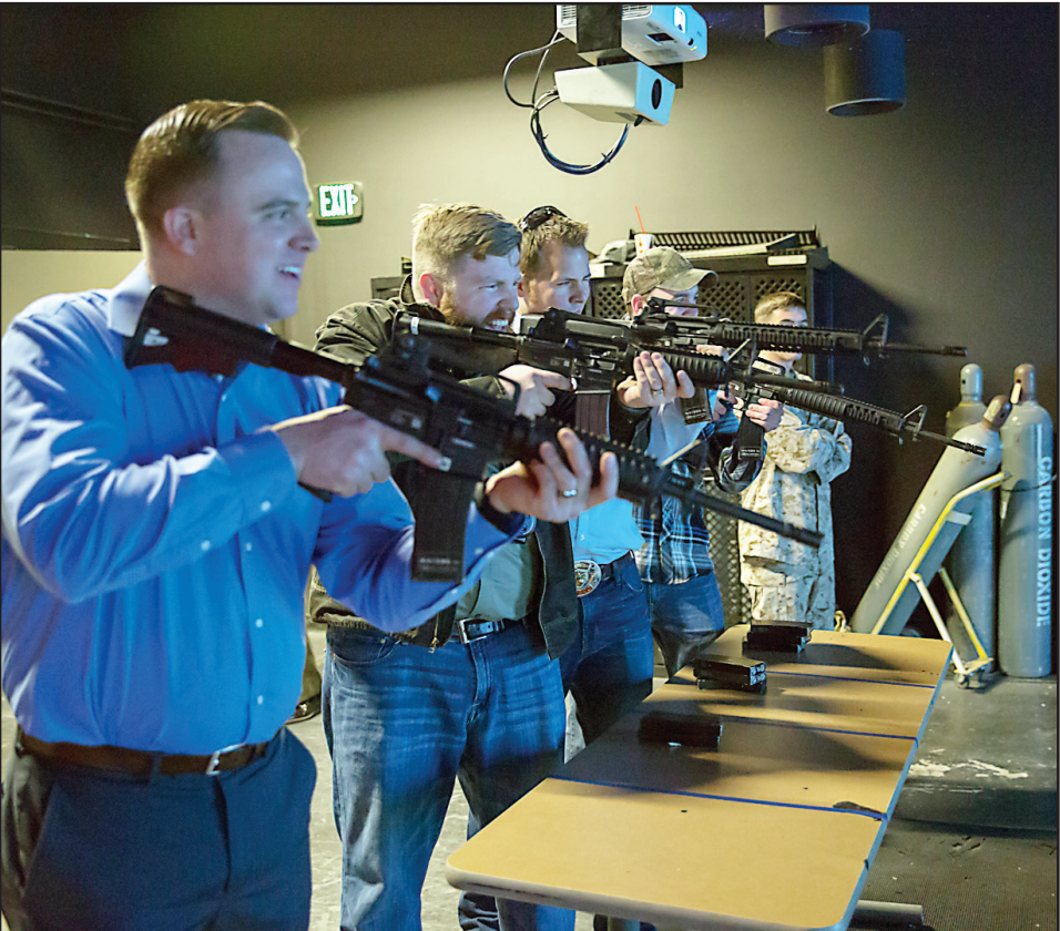
'War Dogs' alumni test their skills in the Indoor Simulated Marksmanship Trainer during 2nd Battalion, 7th Marine Regiment's 75th anniversary at building 1707, Jan. 8.