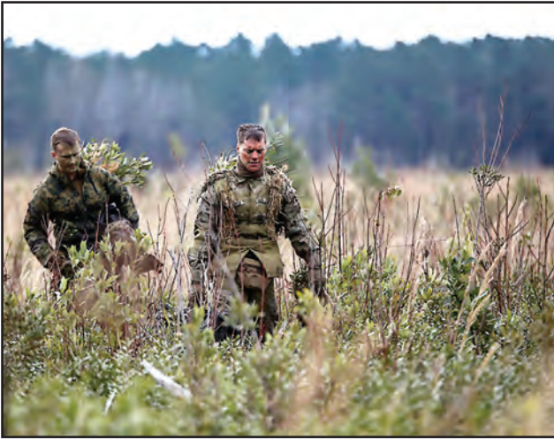
Marine students undergoing the 2nd Marine Division Combat Skills Center's Pre-Scout Sniper Course depart a field following a stalking exercise at Camp Lejeune, N.C., Jan. 22.