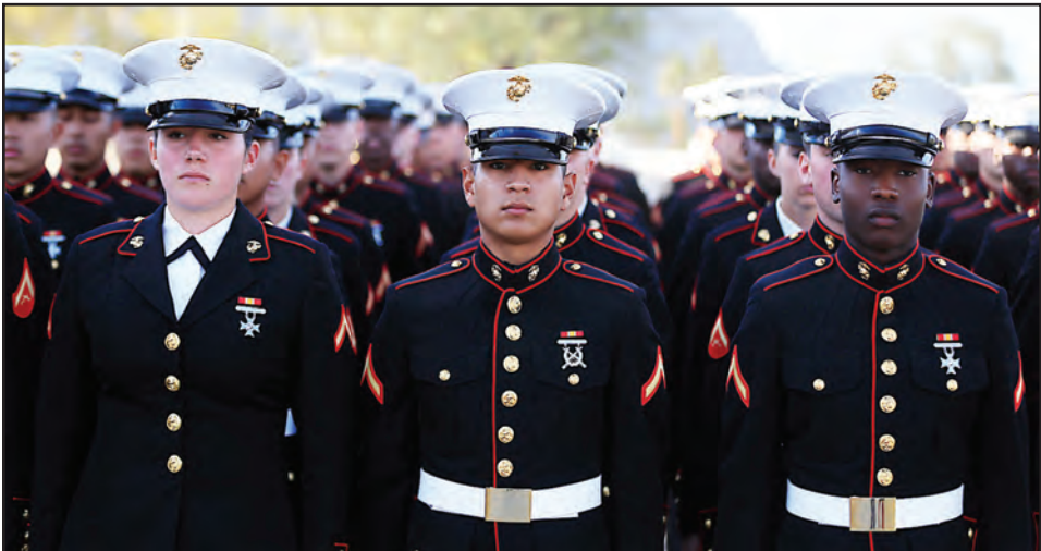
Marine Corps Communication-Electronics School students prepare to march during the Career Builder Challenge Military Appreciation Ceremony at the Tom Weiskopf Private Course located in the Professional Golfers Association of America Course West in La Quinta, Calif., Saturday. More than 50 MCCES Marines marched in formation during the event.