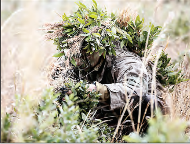
A Marine student undergoing the 2nd Marine Division Combat Skills Center's Pre-Scout Sniper Course prepares to move during a stalking exercise at Camp Lejeune, N.C., Jan. 22.