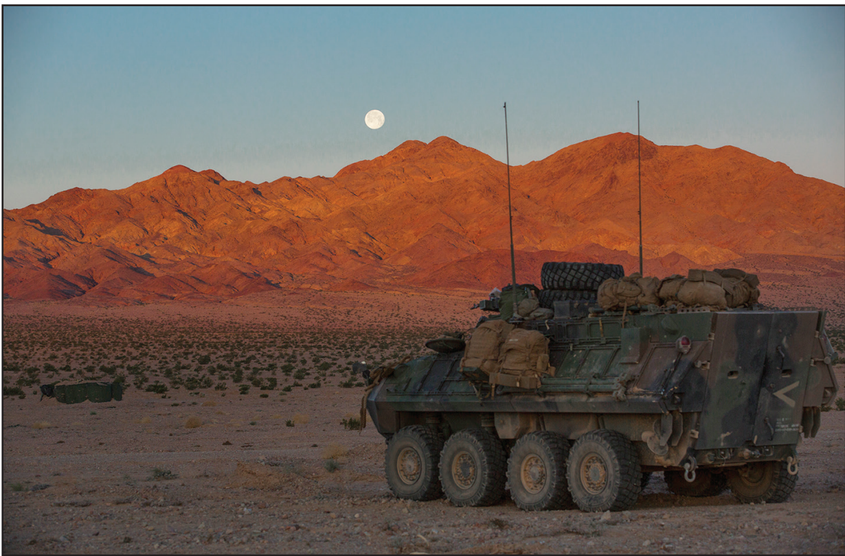
A light armored vehicle with Company B, 3rd Light Armored Reconnaissance Battalion, idles in the Combat Center training area, March 22.