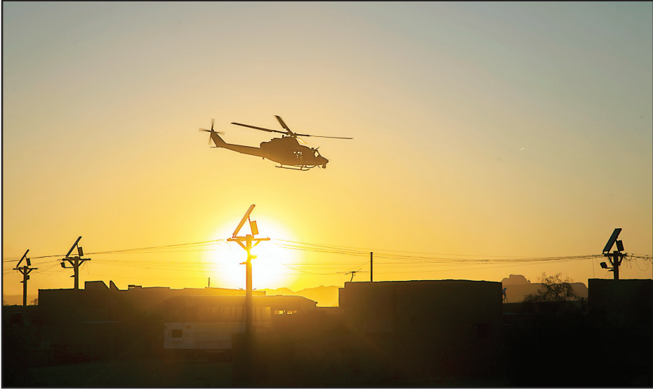
A Marine Corps UH-1Y Venom assigned to Marine Aviation Weapons and Tactics Squadron One flies during an air insertion and extraction exercise as part of Weapons and Tactics Instructor course 2-16, at Yuma Proving Grounds, Yuma, Ariz., Saturday.