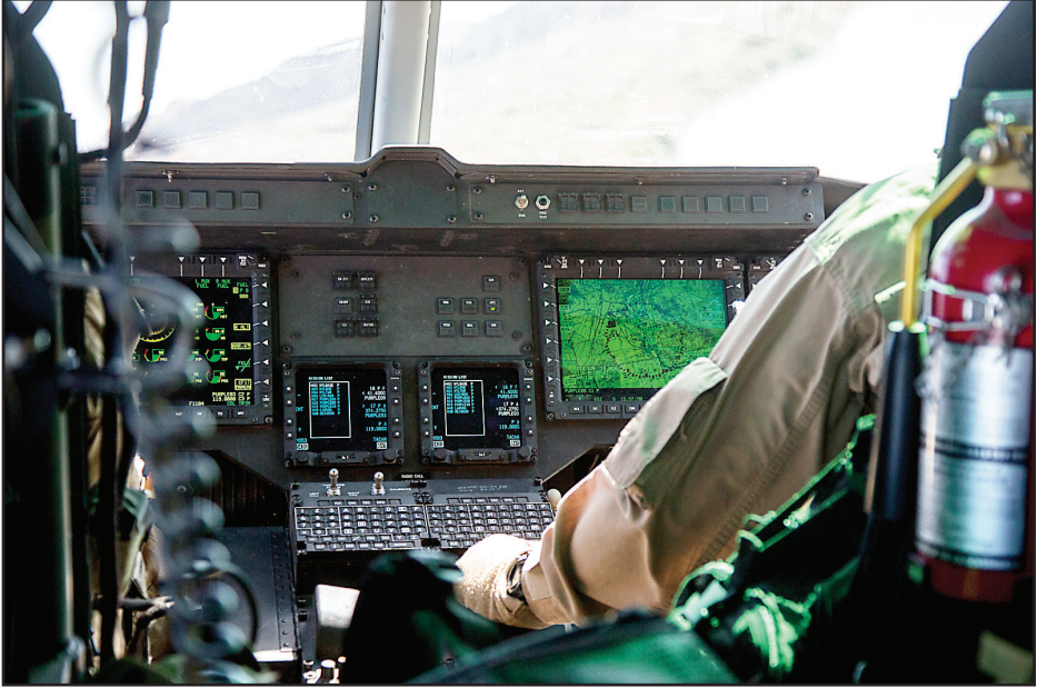
Marine Corps UH-1Y Venom pilots with Marine Aviation Weapons and Tactics Squadron One take off for an air insertion and extraction exercise during Weapons and Tactics Instructor course 2-16 at Yuma Proving Grounds, Yuma, Ariz., Saturday.