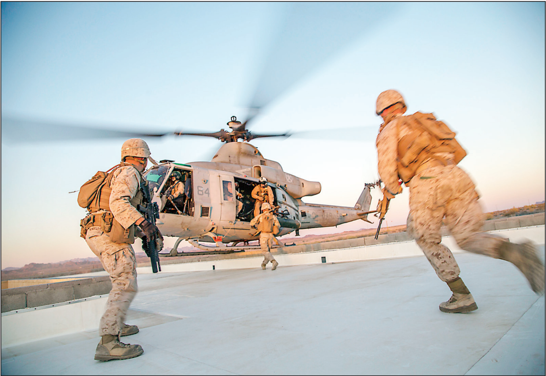
Marines with Lima Company, 3rd Battalion, 6th Marine Regiment, board a UH-1Y Venom assigned to Marine Aviation Weapons and Tactics Squadron One during a roof insertion and extraction exercise, at Yuma Proving Grounds, Yuma, Ariz., Saturday. This evolution was part of Weapons and Tactics Instructor course 2-16, a seven week training event, hosted by MAWTS-1 cadre, which emphasizes operational integration of the six functions of Marine Corps aviation in support of a Marine Air Ground Task Force.