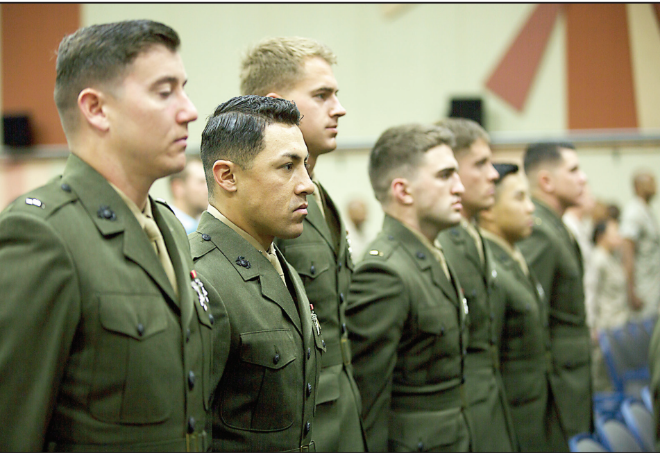
Basic Communications Officer Course 1-16 students stand at the position of attention during the playing of the national anthem during the course’s graduation ceremony at the base theater, April 1.