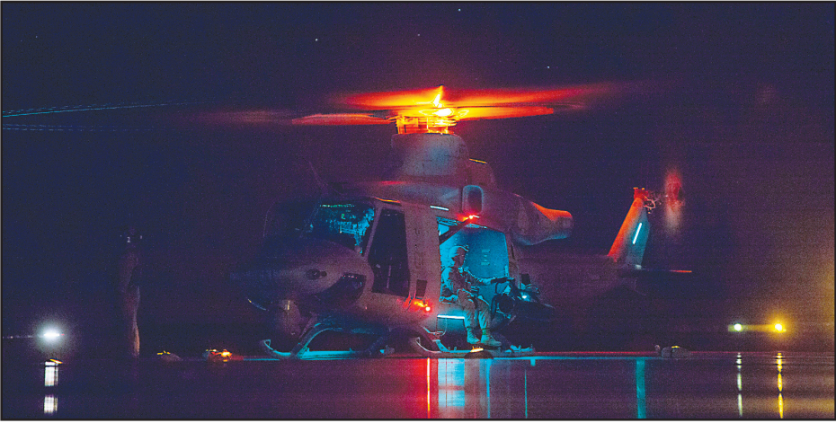
A UH-1Y Venom assigned to Marine Aviation Weapons and Tactics Squadron One, stands by during an air insertion and extraction exercise as part of Weapons and Tactics Instructor course 2-16, at Yuma Proving Grounds, Yuma, Ariz., Saturday.