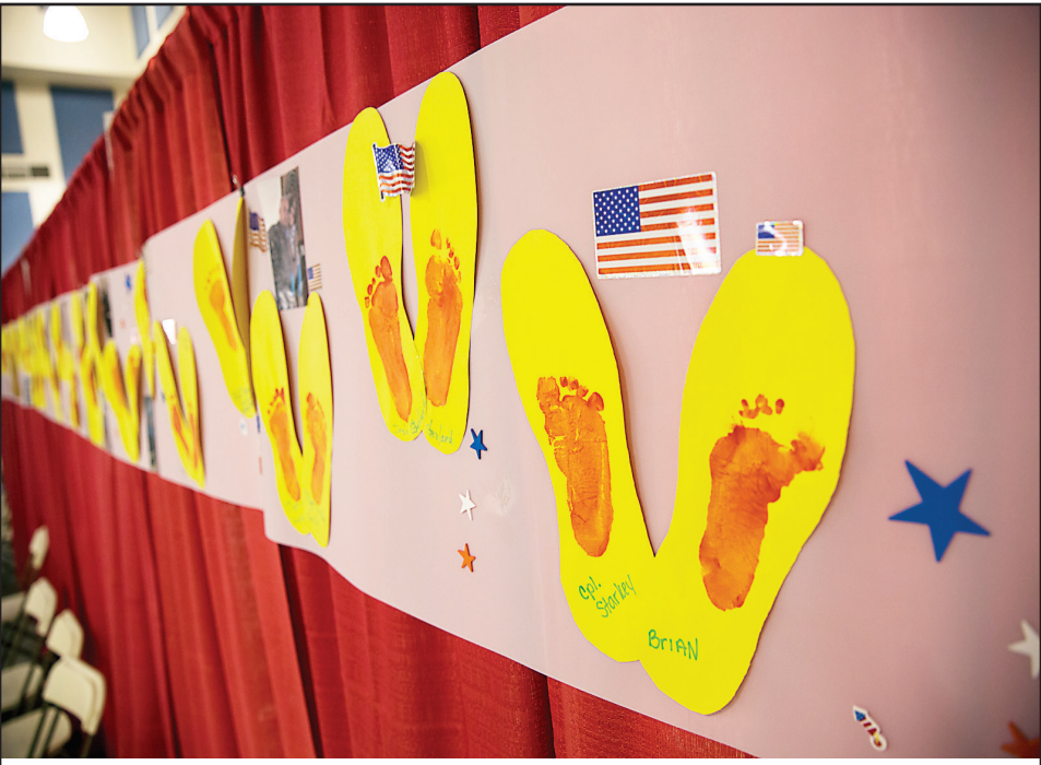
Footprints created by military children at the Combat Center Armed Services YMCA are displayed during the 6th Annual Veteran’s Expo at the Riverside County Fairgrounds in Indio, Calif., Saturday. The children traced their active duty parent’s boot and used their feet to paint their prints in the center.