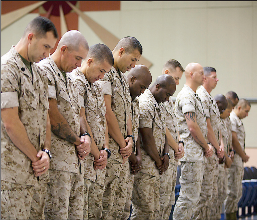
Marines from Communication Training Battalion's Communications Chief Course 1-16 bow their heads during the invocation of the course's graduation ceremony at the base theater, April 1. The course provided the students with overall knowledge of equipment capabilities and system integration of all elements of transmission, telecommunication and information systems found throughout the Marine Corps.