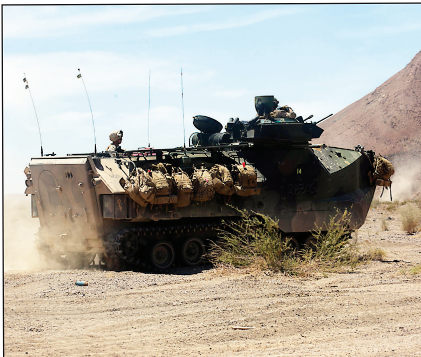
Marines with 3rd Battalion, 2nd Marine Regiment, advance to a simulated enemy defensive position in an Assault Amphibious Vehicle during the final exercise of Integrated Training Exercise 3-16 in the Blacktop Training Area, June 1.