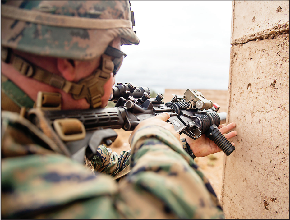
Marines with Company C, 1st Battalion, 1st Marine Regiment, move from building to building to clear them during Exercise Predator Strike at Cultana Training Area, South Australia, Australia, June 5.