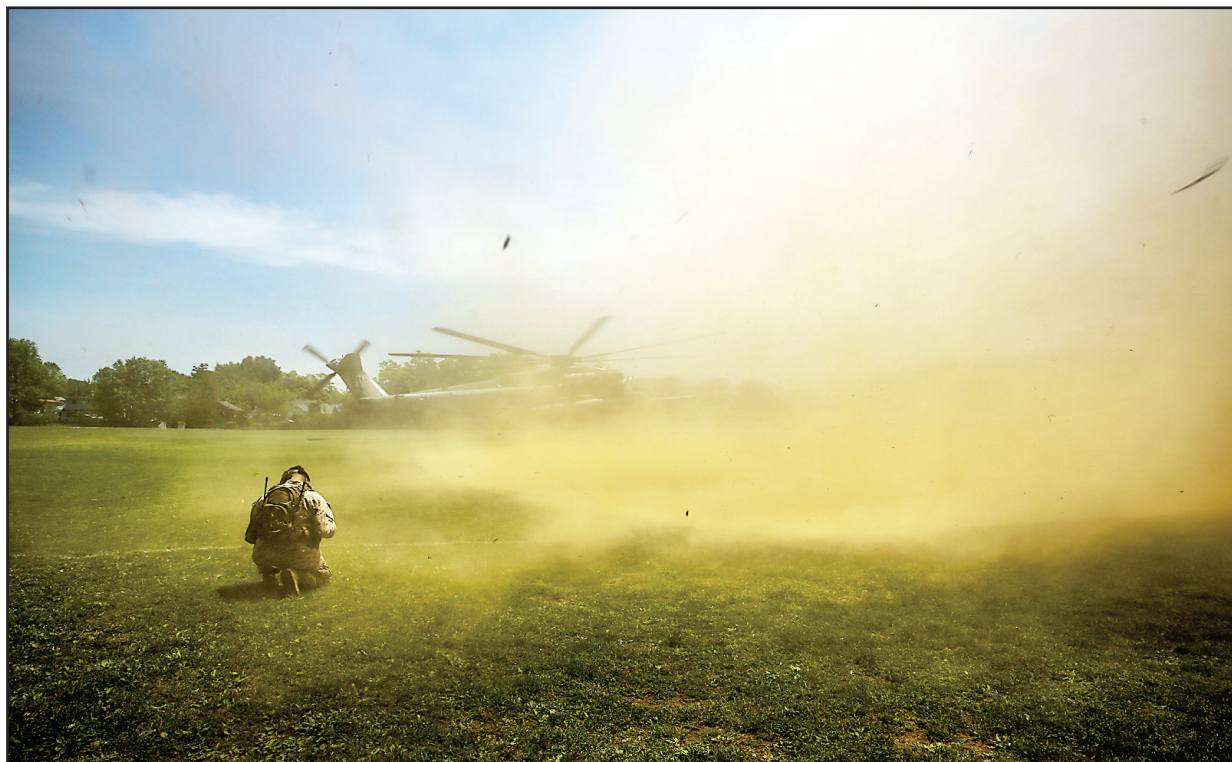
CH-53 Super Stallion with the 24th MEU demonstrates a landing at Massapequa High School in Long Island, New York, May 26. The Marines are visiting the city to interact with the public, demonstrate capabilities and teach the people of New York about America's sea services.