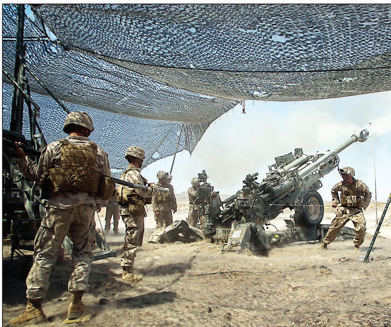
Marines with Battery C, 1st Battalion, 10th Marine Regiment, provide indirect fire with a M777 Howitzer during the final exercise of Integrated Training Exercise 3-16 in the Blacktop Training Area, June 1.