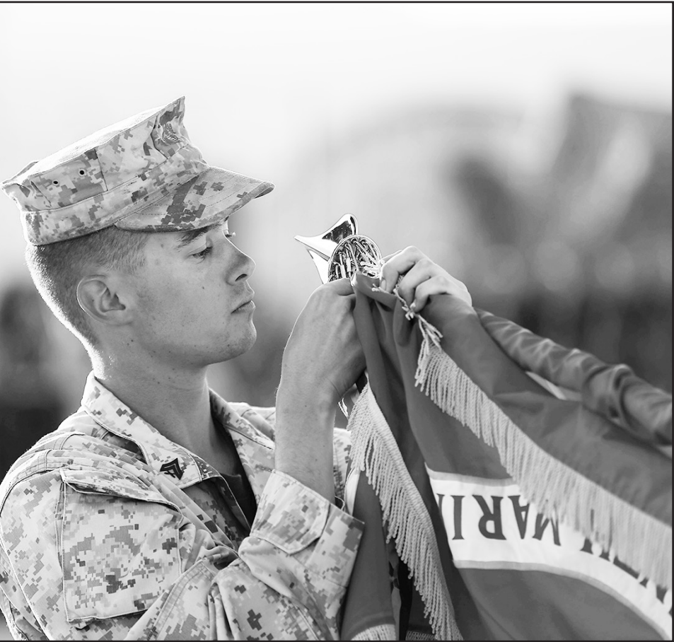
Clockwise from top left: Marines with 7th Marine Regiment, 1st Marine Division, hold the regiment's campaign ribbons as they stand in formation for a ceremony for the regiment's 99th anniversary aboard the Combat Center, Sunday. The 7th Marine Regiment has a rich history spanning from the Banana Wars and Guadalcanal to today's Operation Inherit Resolve.

Marines with 7th Marine Regiment holds a ceremony for the regiment's 99th anniversary aboard the Combat Center, Sunday.