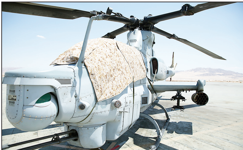
A Bell AH-1Z helicopter based out of Marine Corps Base Camp Pendleton, Calif. Marine Light Attack Helicopter Squadron 169 sits idle with a canopy cover on the flight deck at the Strategic Expeditionary Landing Field aboard the Combat Center, Aug. 5.

would do quick pre-flight checks, but it would get so hot that their hands would start burning through their gloves, or the multi-function displays would overheat."