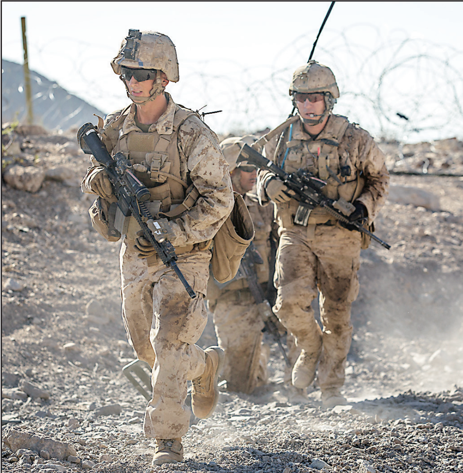
Marines with 2nd Battalion, 5th Marine Regiment, move to provide cover fire on an objective at Range 400 aboard the Combat Center, Aug. 10, during Integrated Training Exercise 5-16.