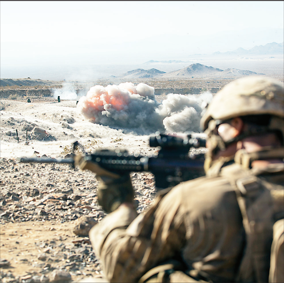
A Marine with 2nd Battalion, 5th Marine Regiment, provides cover fire as Marines destroy an objective at Range 400 aboard the Combat Center, Aug. 10, during Integrated Training Exercise 5-16.