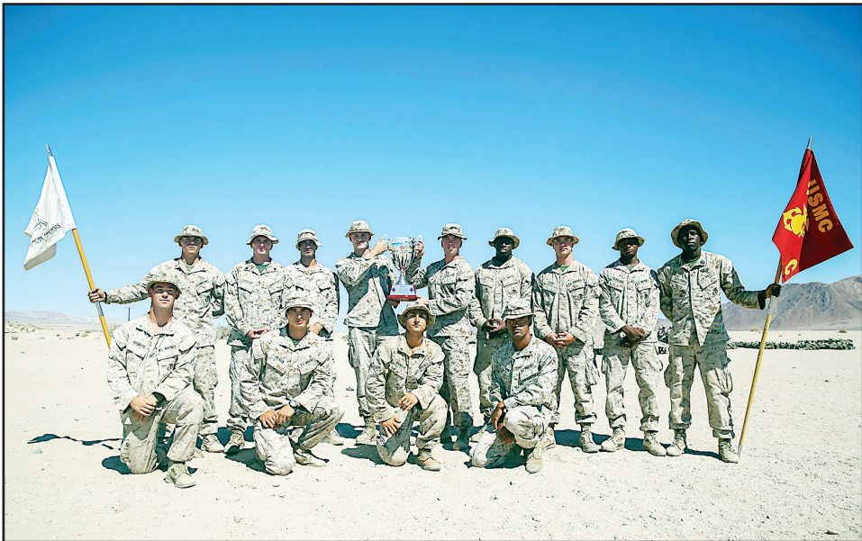
The winning squad from Company C, 1st Battalion, 7th Marine Regiment holds the 1st Marine Division Super Squad Mitchell Cup trophy with the company's two guidons aboard the Combat Center, Monday.

The Super Squad Competition is a three day non-stop event that pins squads from 1st Marine Regiment, 5th Marine Regiment, 7th Marine Regiment, 1st Light Armored Reconnaissance Battalion and 3rd Light See Squad pg. A6