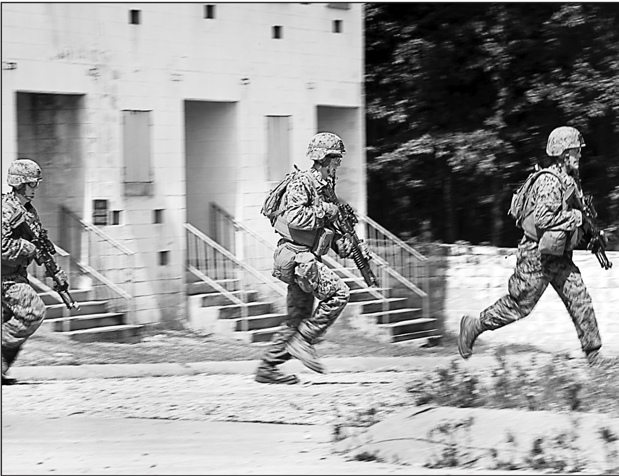
Marines with Bravo Company, 1st Battalion, 2nd Marine Regiment, run toward a simulated enemy during a raid drill at Fort Pickett, Va., Aug. 25. During the training, the unit worked to enhance their infantry skills in urban environments.