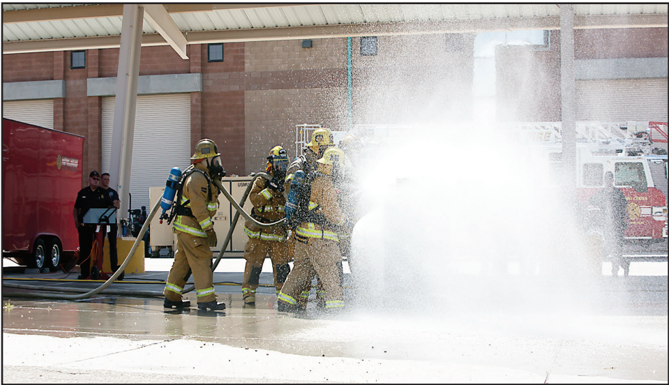
Combat Center firefighters extinguish a simulated propane fire at the fire station aboard the Marine Corps Air Ground Combat Center, Twentynine Palms, Calif., Aug. 26.

The training keeps the members of the fire department up to the task of responding to any emergency so they may continue to improve the quality of life of the Combat Center and the surrounding communities.