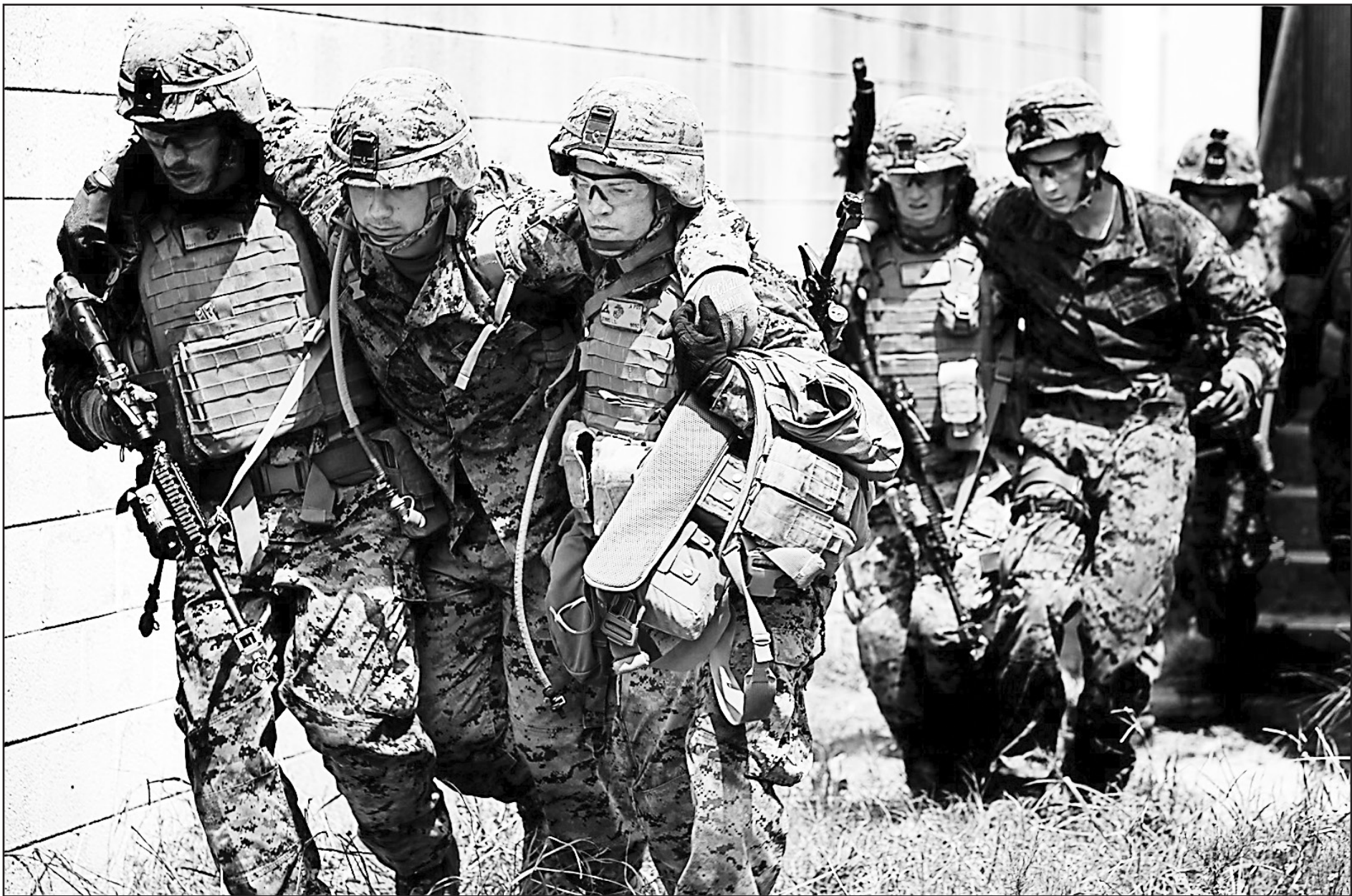
Marines with Bravo Company, 1st Battalion, 2nd Marine Regiment, evacuate two simulated casualties from an enemy compound during mobile operations in urban terrain training at Fort Pickett, Va., Aug. 25. The unit trained to enhance their coordination and communication skills in an urban environment.