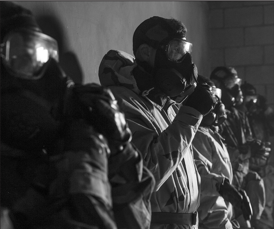
Marines with Headquarters Battalion prepare to qualify in the confidence chamber at Range 105, Aug. 26.