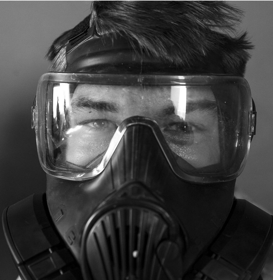
A Marine with Headquarters Battalion prepares to qualify in the confidence chamber at Range 105, Aug. 26.