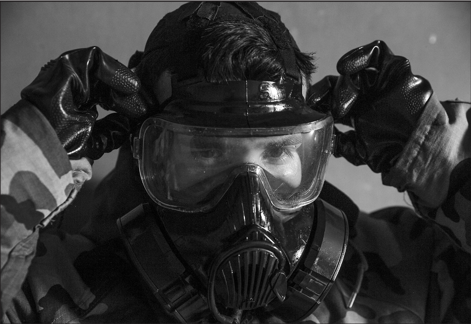
A Marine with Headquarters Battalion breaks the seal on his M50 Joint-Service General Purpose Mask to qualify in the confidence chamber at Range 105, Aug. 26.