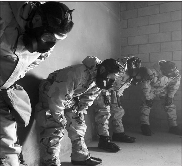
Marines with Headquarters Battalion perform exercises to ensure their M50 Joint-Service General Purpose Mask are properly sealed before qualifying in the confidence chamber at Range 105, Aug. 26.