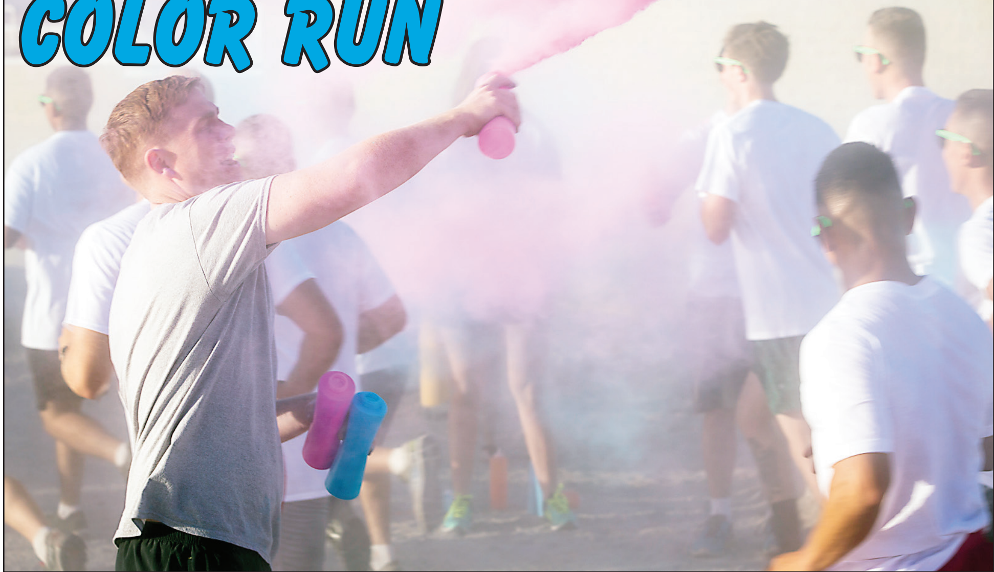
A Marine with 1st Battalion, 7th Marine Regiment, throws colored cornstarch on runners during the battalion-wide 5k color run aboard the Combat Center, Sept. 2.