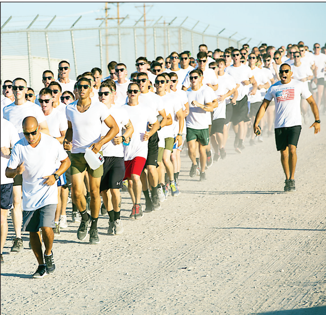
Marines and sailors with 1st Battalion, 7th Marine Regiment, participate in a battalion-wide 5k Color Run aboard the Combat Center, Sept. 2.