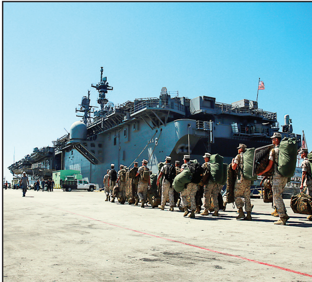
First ever LA Fleet Week