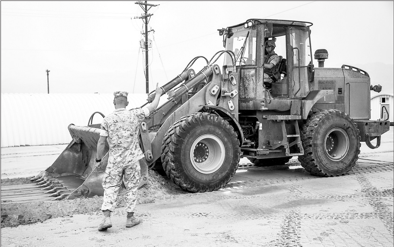
Marines with Combat Logistics Battalion 7 lay the foundation for additional expeditionary steel structures, known as K-Spans, at Camp Wilson aboard the Combat Center, Sept. 23.