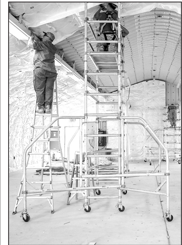
Marines with Combat Logistics Battalion 7 lay the foundation for additional expeditionary steel structures, known as K-Spans, at Camp Wilson aboard the Combat Center, Sept. 23.