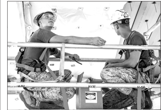
Marines with Combat Logistics Battalion 7 lay the foundation for additional expeditionary steel structures, known as K-Spans, at Camp Wilson aboard the Combat Center, Sept. 23.