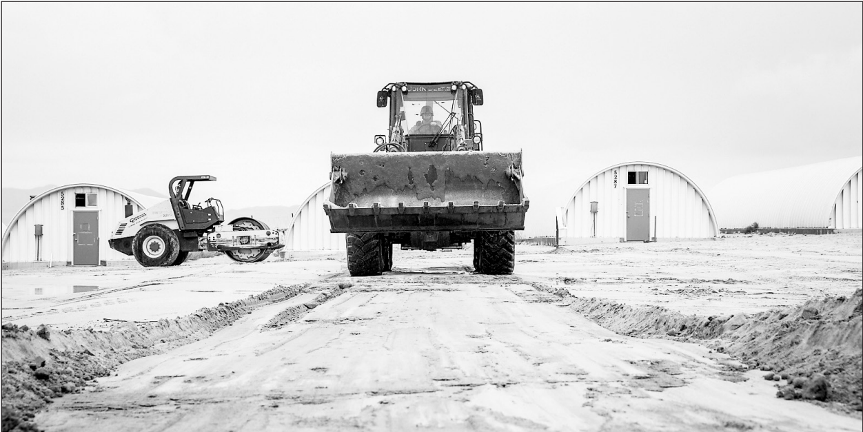
Marines with Combat Logistics Battalion 7 lay the foundation for additional expeditionary steel structures, known as K-Spans, at Camp Wilson aboard the Combat Center, Sept. 23. The structures will improve the installation’s ability to support units as they conduct combined arms live-fire exercises.