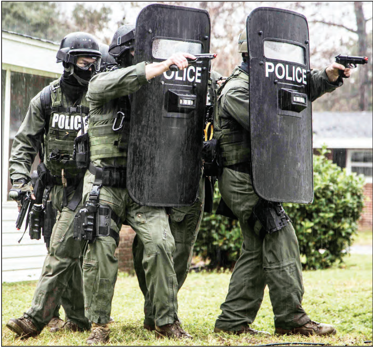
Marines with the Special Reaction Team conduct hostage scenario training aboard Laurel Bay, S.C., Feb. 4. SRT physically responded to the situation utilizing their personal protective equipment and tactics.