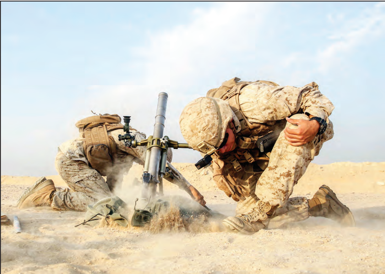
Marines with A Company, 1st Battalion, 5th Marine Regiment, fire a M224 60mm lightweight mortar system during a live-fire mortar range, Oct. 18. The 15th MEU is embarked on the America ARG and is deployed to maintain regional security in the U.S. 5th Fleet area of operations.