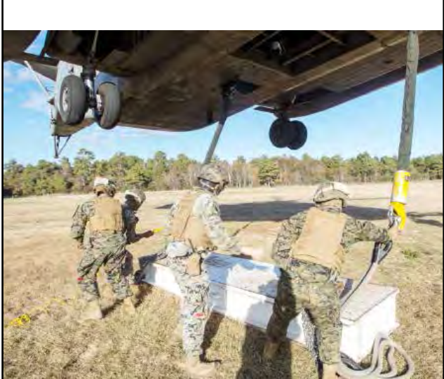
Marines with Combat Logistics Battalion 6, 2nd Marine Logistics Group attach cables and practice materials to a CH-53E Super Stallion during Helicopter Support Team training at Camp Lejeune, N.C., Tuesday.