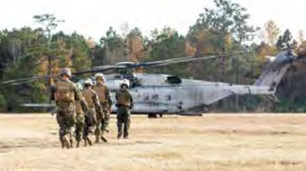
Marines with Combat Logistics Battalion 6, 2nd Marine Logistics Group walk toward a CH-53E Super Stallion at Camp Lejeune, N.C., Tuesday.