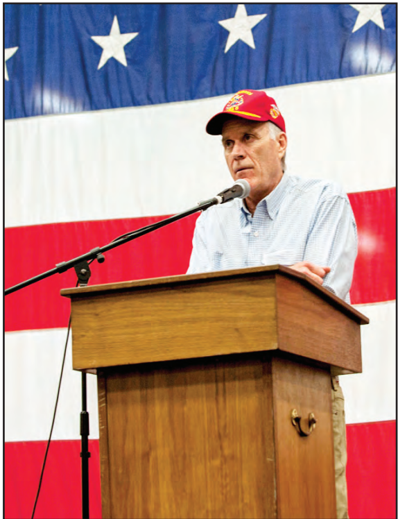
SECNAV speaks to Marines, sailors on the USS America See page B1