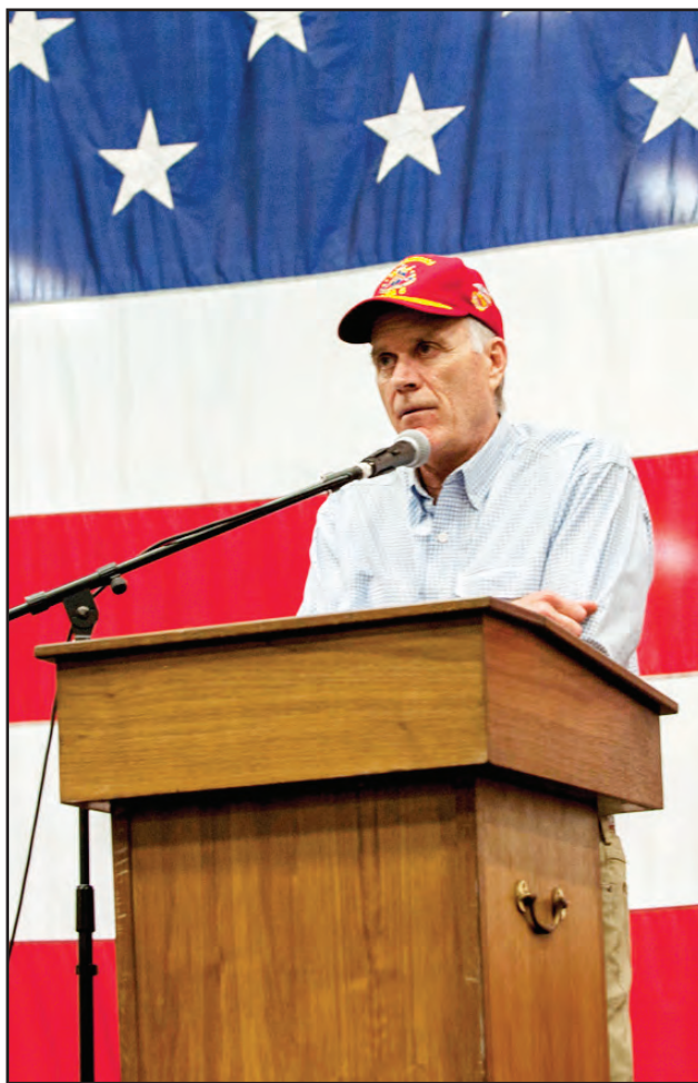
Secretary of the Navy Richard V. Spencer speaks to Sailors and Marines during an all hands call in the hangar bay of the amphibious assault ship USS America during his visit, Nov. 23.

Spencer conducted a mass reenlistment and fielded questions from the crowd ranging from