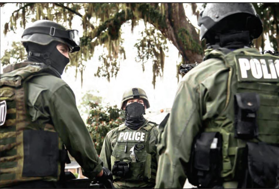
Marines brief prior to conducting a hostage scenario training aboard Laurel Bay, S.C., Feb. 4.