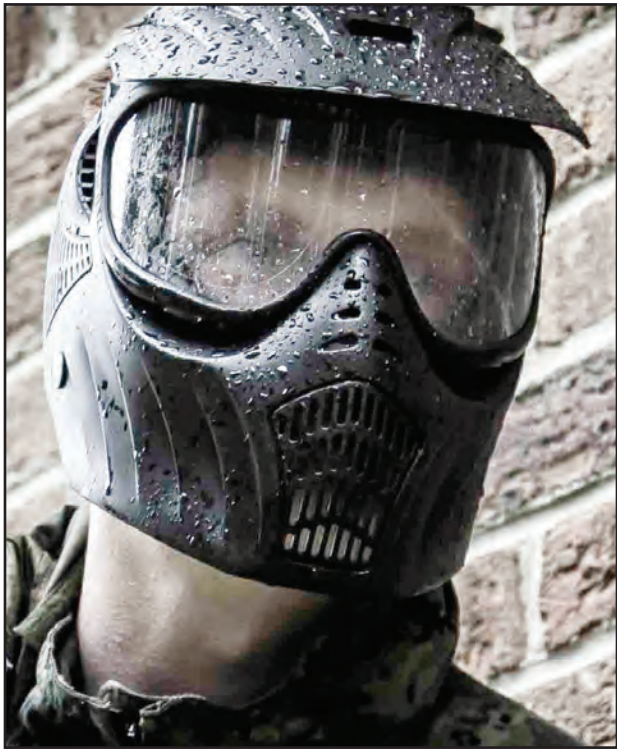
A Marine with the Special Reaction Team stands guard during hostage situation training aboard Laurel Bay, S.C., Feb. 4.