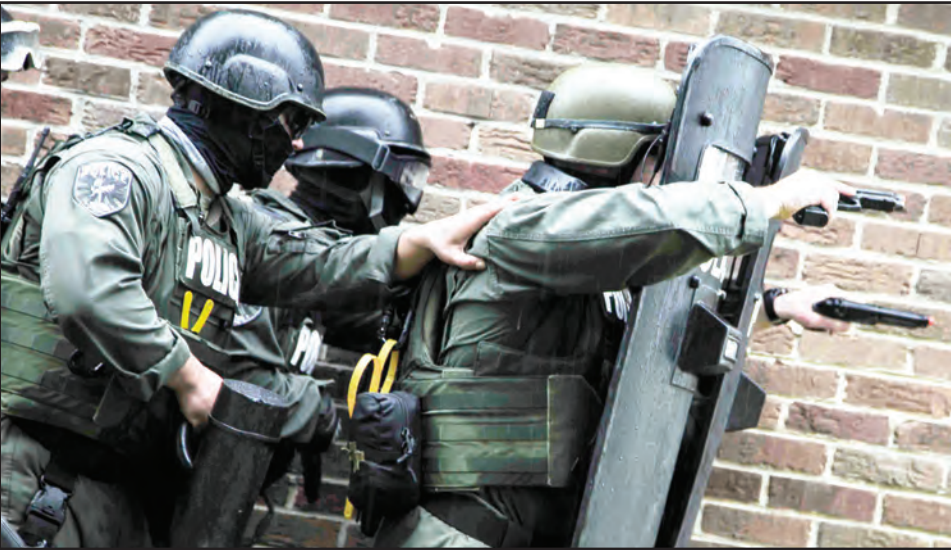
Marines with the Special Reaction Team conduct hostage scenario training aboard Laurel Bay, S.C., Feb. 4.