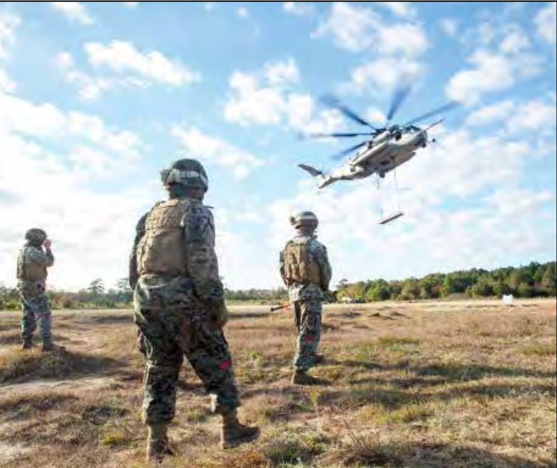
Marines with Combat Logistics Battalion 6, 2nd Marine Logistics Group observe a CH-53E Super Stallion during Helicopter Support Team training at Camp Lejeune, N.C., Tuesday.