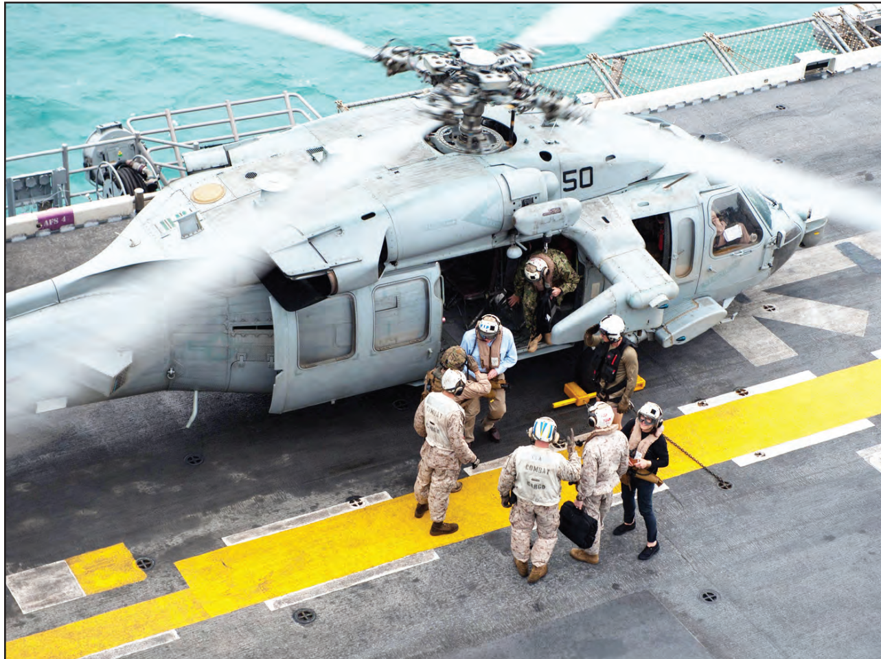
Secretary of the Navy Richard V. Spencer, disembarks from an MH-60S Sea Hawk helicopter assigned to the “Wildcards” of Helicopter Sea Combat Squadron 23 on the flight deck during his arrival aboard the amphibious assault ship USS America, Nov. 23.