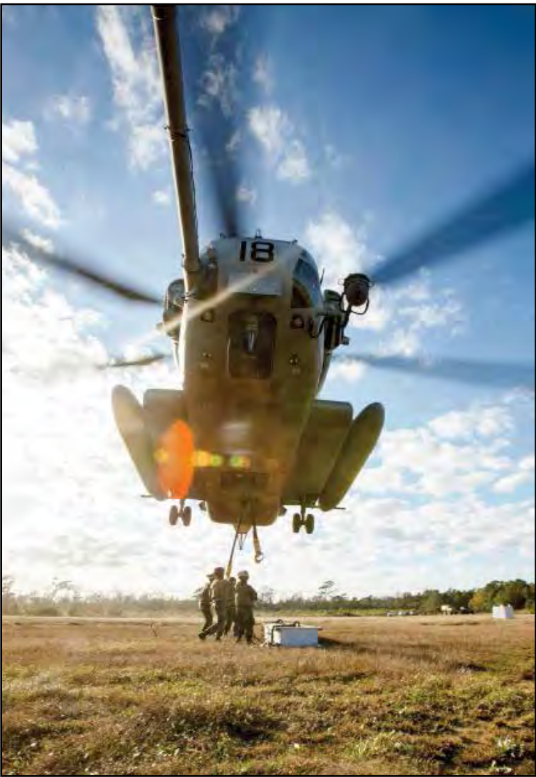
Marines with Combat Logistics Battalion 6, 2nd Marine Logistics Group attach cables and practice materials to a CH-53E Super Stallion during Helicopter Support Team training at Camp Lejeune, N.C., Tuesday. A Helicopter Support Team is comprised of approximately eight landing support specialist Marines who ensure the equipment is properly attached and secured before pilots transport the gear or supplies to their destination.