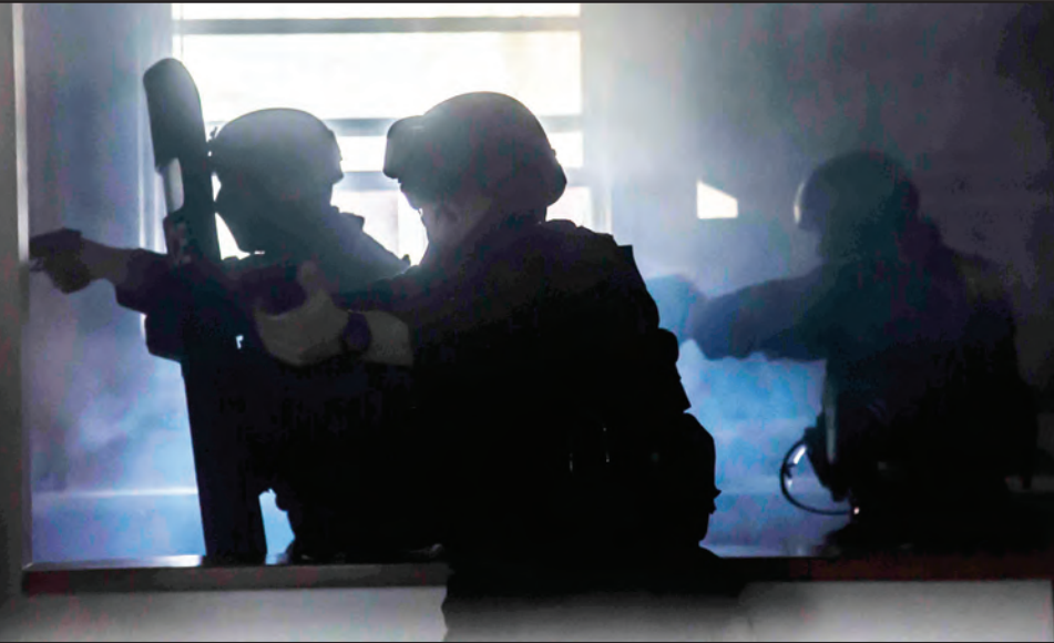
Marines with the Special Reaction Team breach a house during hostage scenario training aboard Laurel Bay, S.C., Feb. 4.