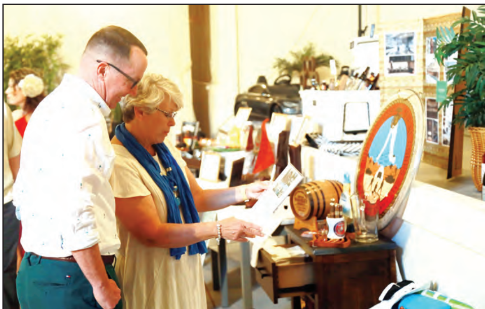
Guests look at one of many auction bundles during the Havana Nights Gala & Benefit Auction hosted by Smith's Ranch in Twentynine Palms, Calif., Saturday.