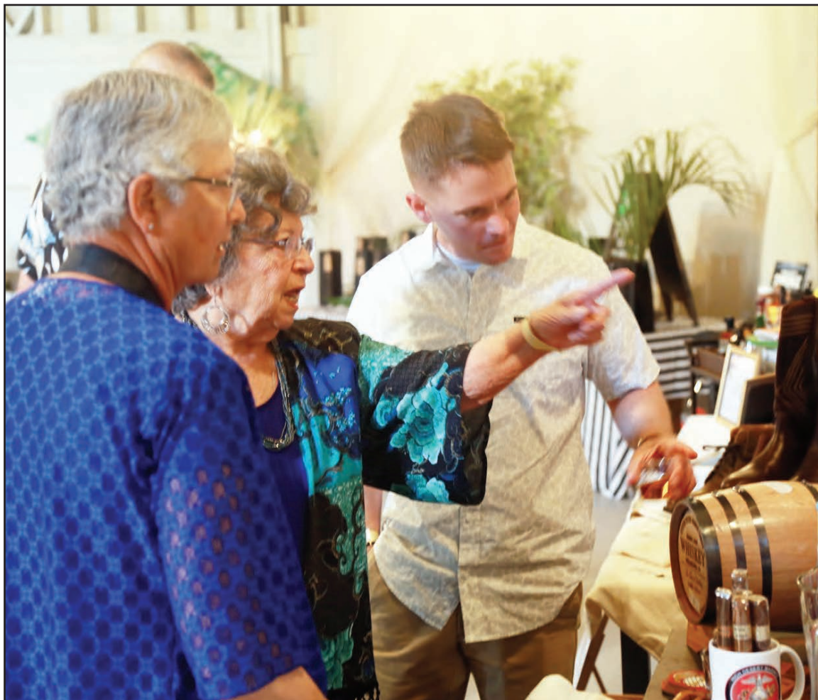
Guests look at one of many auction bundles during the Havana Nights Gala & Benefit Auction hosted by Smith's Ranch in Twentynine Palms, Calif., Saturday.