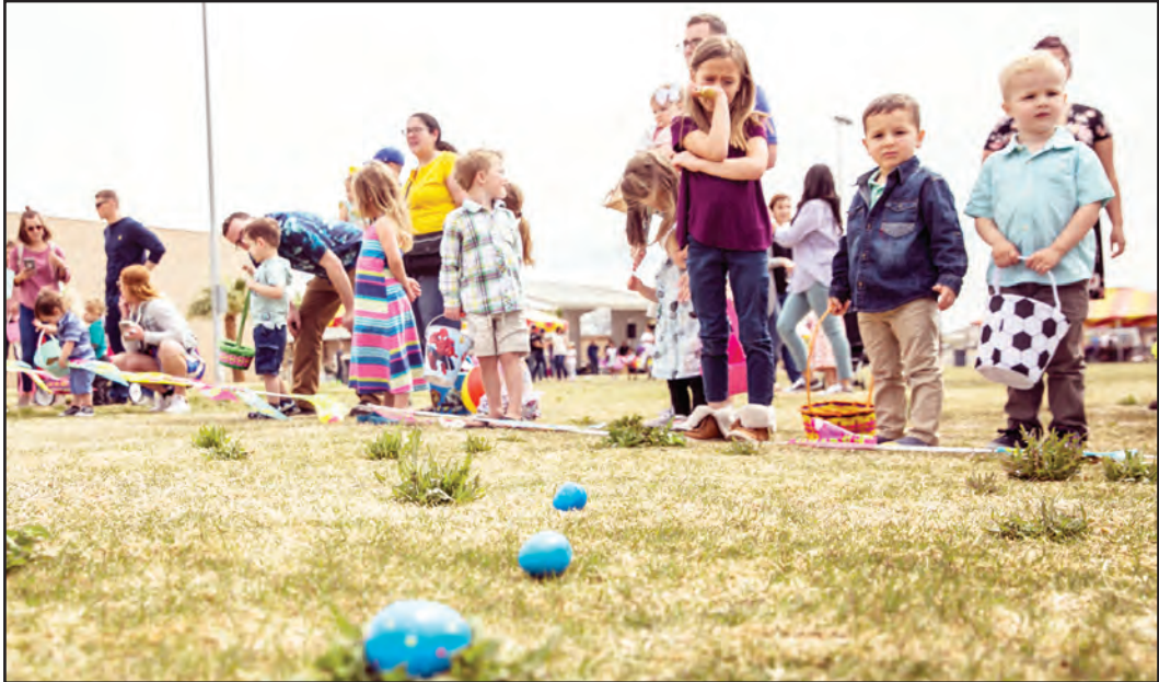
Children of Marines and sailors with 1st Battalion, 7th Marine Regiment, line up to begin an Easter egg hunt during a spring family day at Victory Field aboard the Combat Center, Saturday.