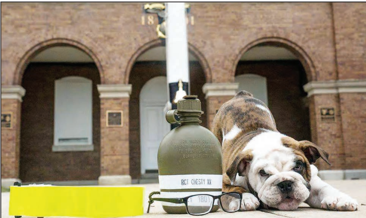
Recruit Chesty XV prepares to put on his gear as he arrives at Marine Barracks Washington, Washington D.C., March 19. Chesty begins his recruit training at Marine Barracks Washington effective immediately!