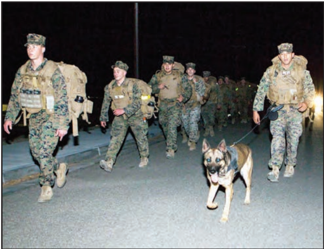
Marines with Alpha Company, Headquarters Battalion participate in a 6 mile company hike aboard the Combat Center, March 23. The Marines regularly conduct company level physical training events in order to maintain physical readiness for upcoming field operations.