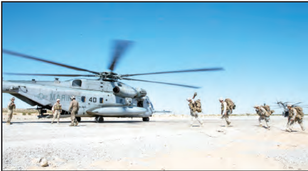
Marines with 3rd Battalion, 4th Marines, 7th Marine Regiment board a CH-53E Super Stallion during Integrated Training Exercise 3-18 aboard the Combat Center, May 18. ITX is a large-scale, combined-arms training exercise intended to produce combat-ready forces capable of operating as an integrated Marine Air Ground Task Force.