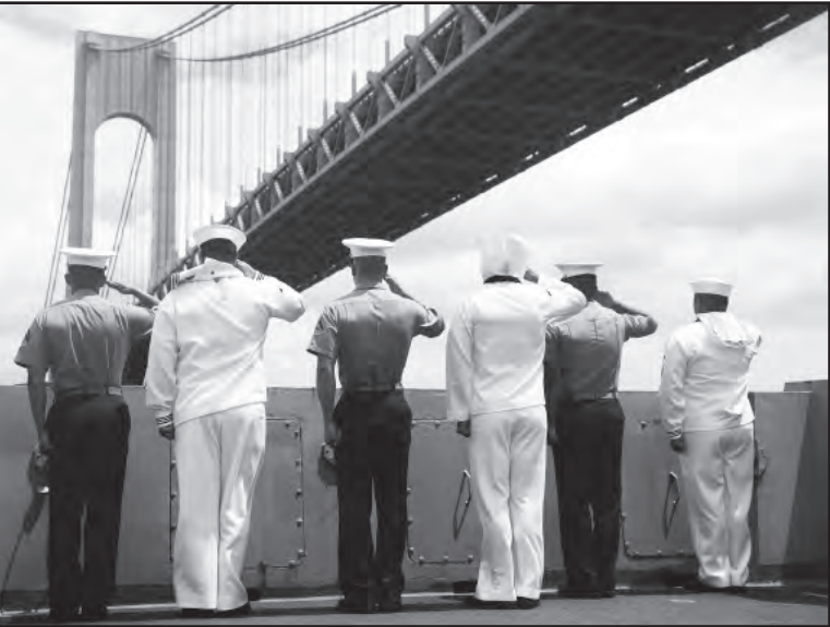
Marines and sailors with Special Purpose Marine Air-Ground Task Force Fleet Week New York man the rails of USS Arlington (LPD 24) to commemorate the beginning of Fleet Week New York, Wednesday.