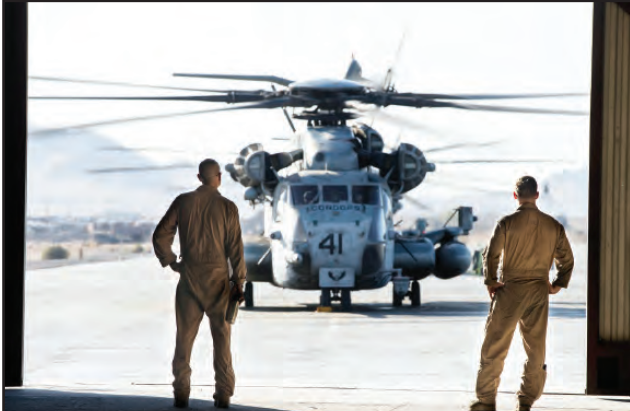
Marines with Marine Heavy Helicopter Squadron 464 observe CH-53E Super Stallions during Integrated Training Exercise 3-18 aboard the Combat Center, April 27.