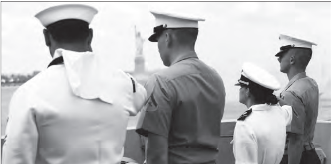
Marines and sailors with Special Purpose Marine Air-Ground Task Force Fleet Week New York salute the Statue of Liberty from the deck of USS Arlington (LPD 24) to commemorate the beginning of Fleet Week New York, Wednesday.