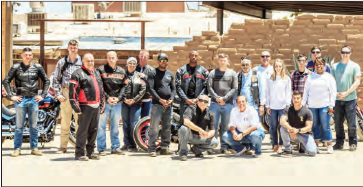
The 4th Annual Ride for Freedom, Freedom to Ride (Sober) Motorcycle Ride participants gather at Pappy and Harriet's in Pioneer Town, Calif., May 18.