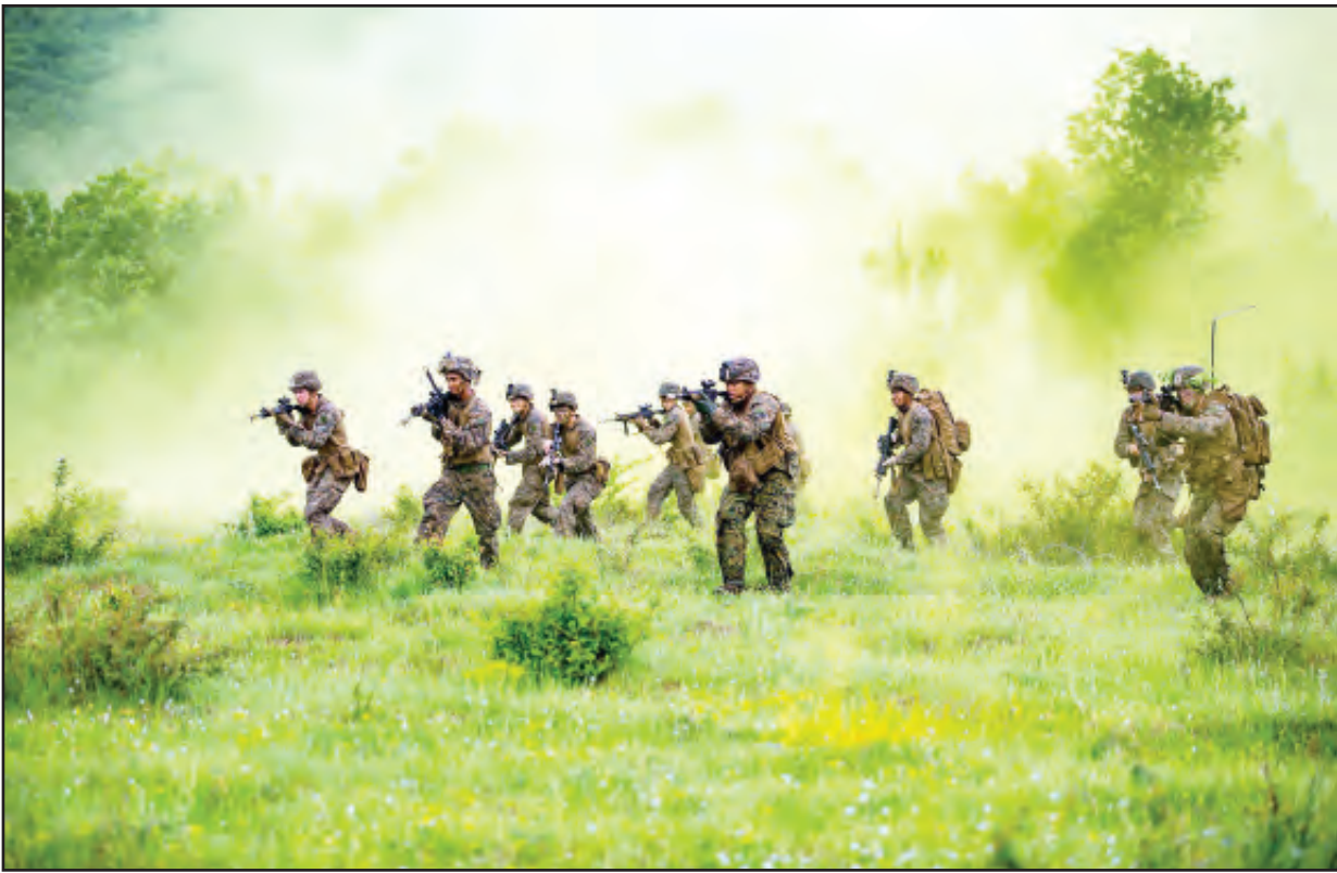
Marines with Black Sea Rotational Force 18.1 advance to their objective during a patrolling exercise (PEX) at U.S. Army base Nova Selo Forward Operating Site, Bulgaria, May 10. PEX enhances platoon readiness and increases the ability to conduct patrols at the squad level.

Every week, thousands of fans cast their votes for the best photograph posted on the Corps' Facebook page. This week's top shot comes from Lance Cpl. Angel D. Travis.