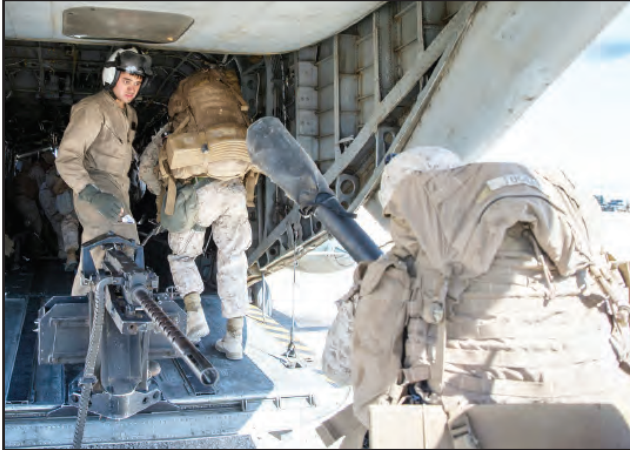
Marines with 3rd Battalion, 4th Marines, 7th Marine Regiment board a CH-53E Super Stallion during Integrated Training Exercise 3-18 aboard the Combat Center, May 18.