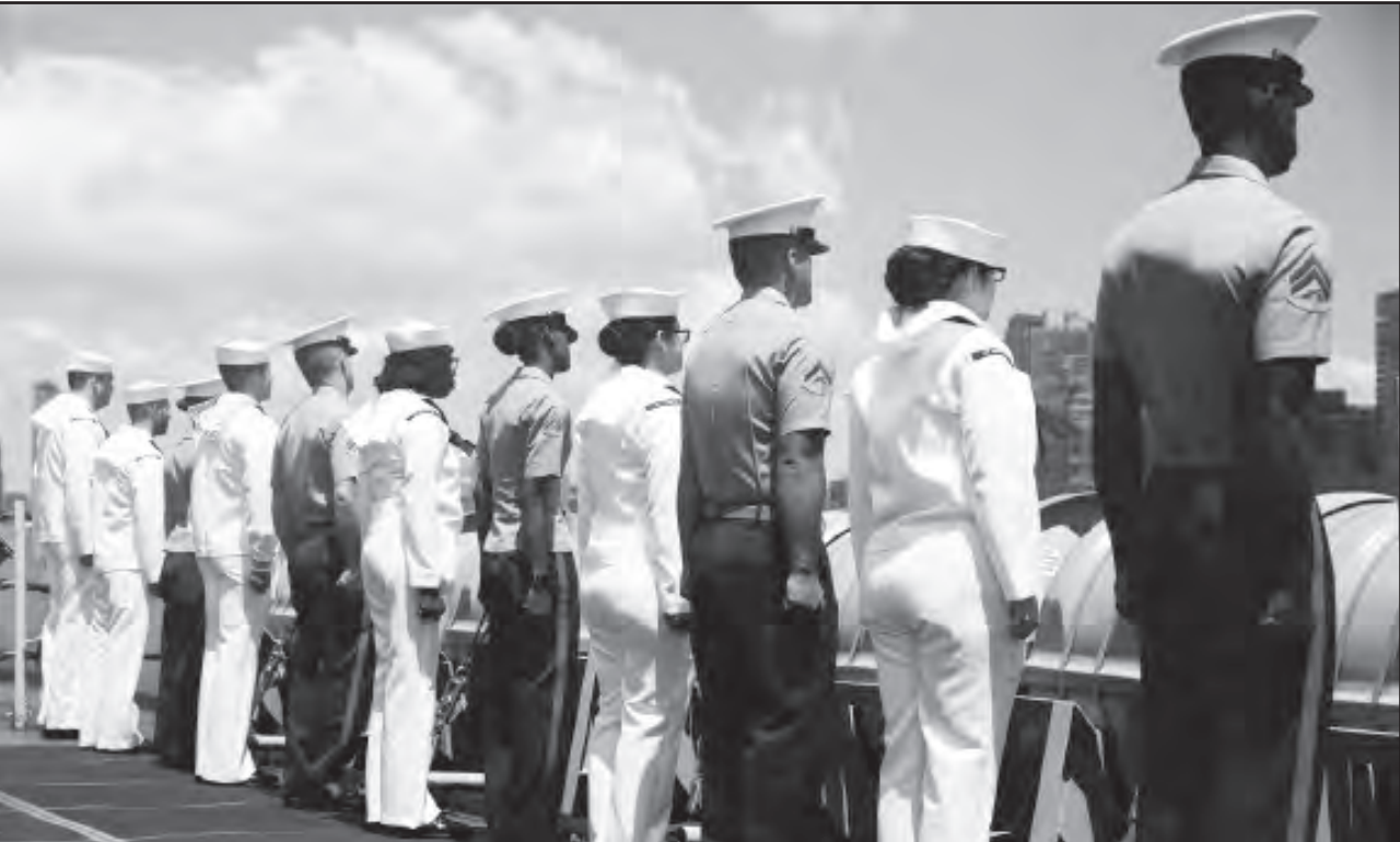
Marines and sailors with Special Purpose Marine Air-Ground Task Force Fleet Week New York man the rails of USS Arlington (LPD 24) to commemorate the beginning of Fleet Week New York, Wednesday.