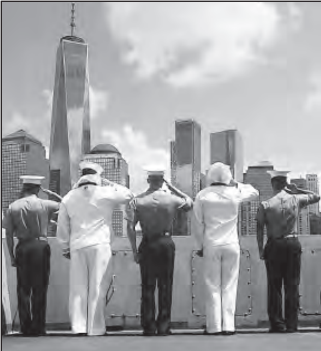
Marines and sailors with the Special Purpose Marine Air-Ground Task Force Fleet Week New York render honors as they pass Freedom Tower, One World Trade Center, aboard USS Arlington (LPD 24) to commemorate the beginning of Fleet Week New York, Wednesday.